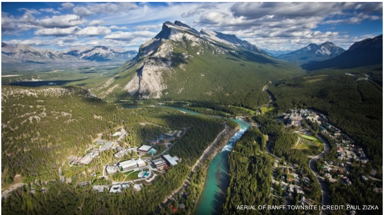
AERIAL OF BANFF TOWNSITE