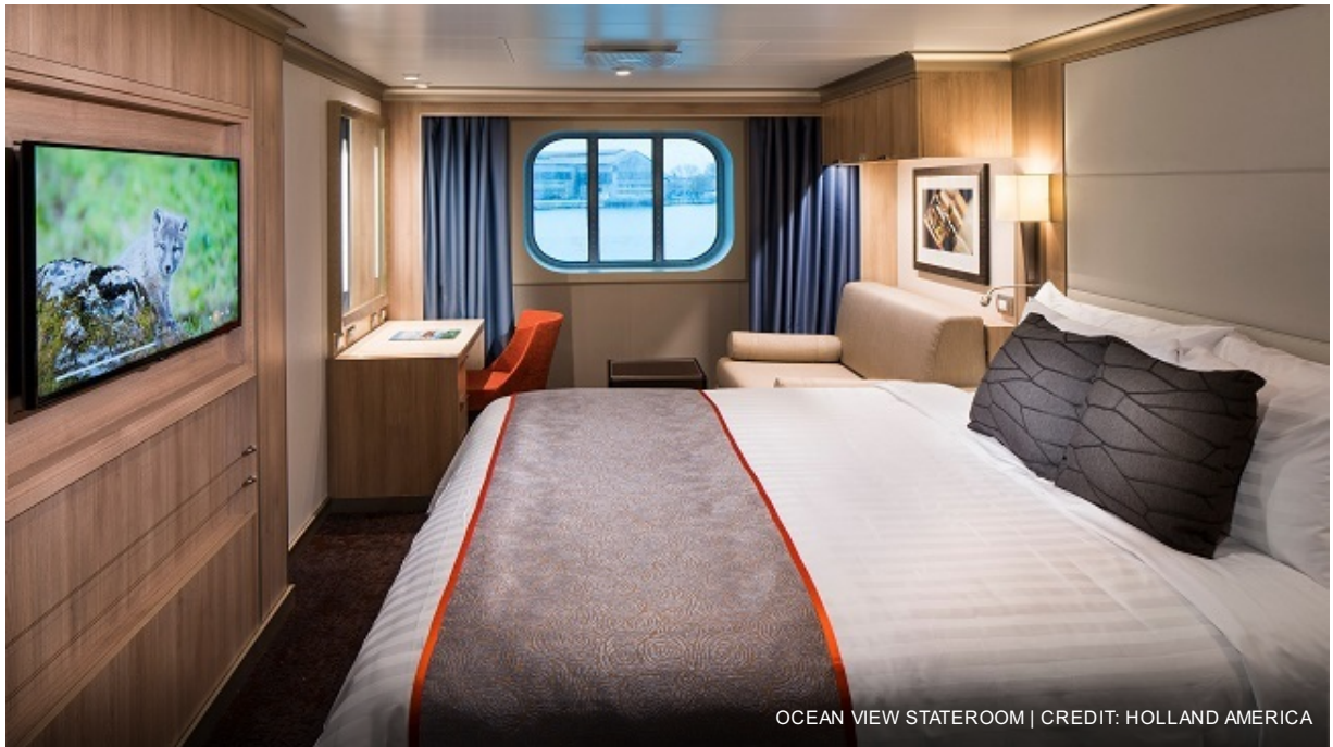
OCEAN VIEW STATEROOM

Stay in an Ocean View Stateroom . The expansive staterooms include two lower beds convertible to one queen-size bed—the Signature Mariner's Dream™ bed with plush Euro-Top mattresses, premium massage shower heads, a host of amenities and an ocean view.