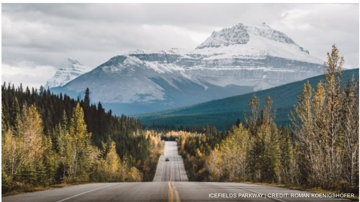
ICEFIELDS PARKWAY