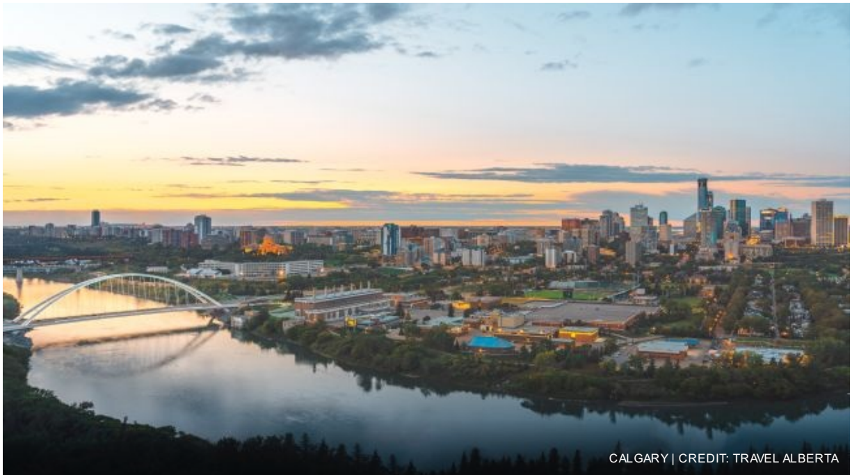
CALGARY

Overnight in Calgary at Delta Hotels by Marriott Calgary Downtown