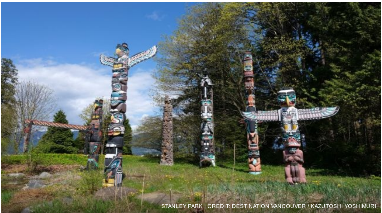
STANLEY PARK