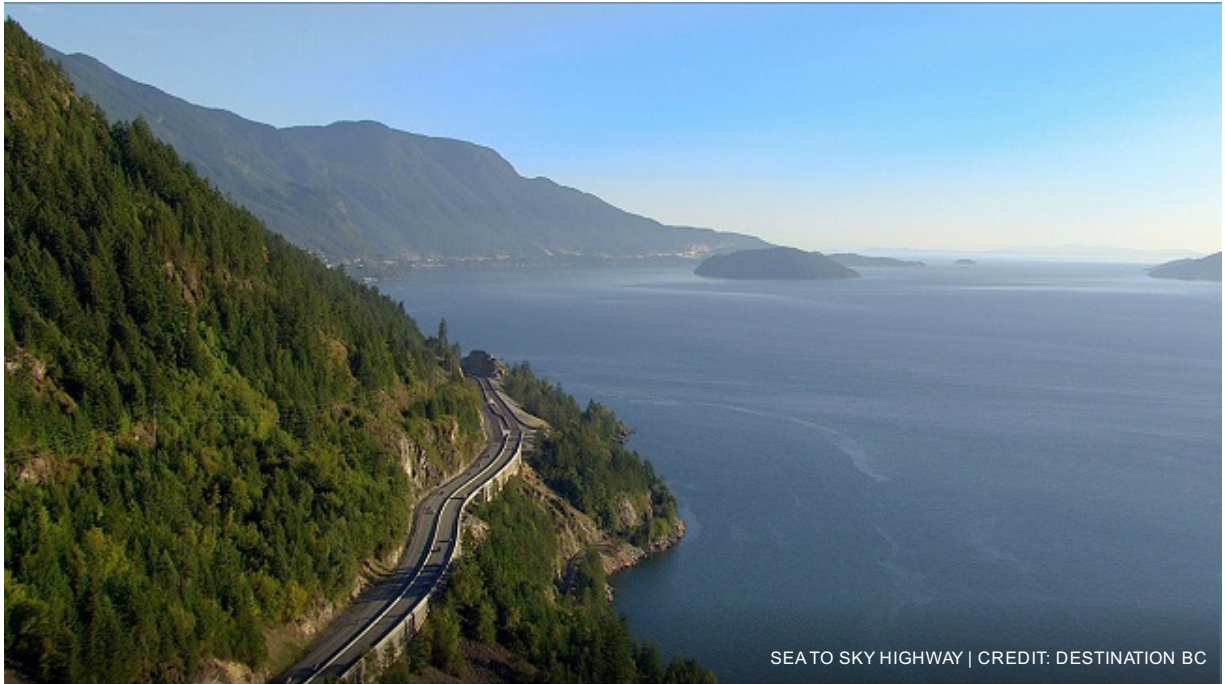
SEA TO SKY HIGHWAY