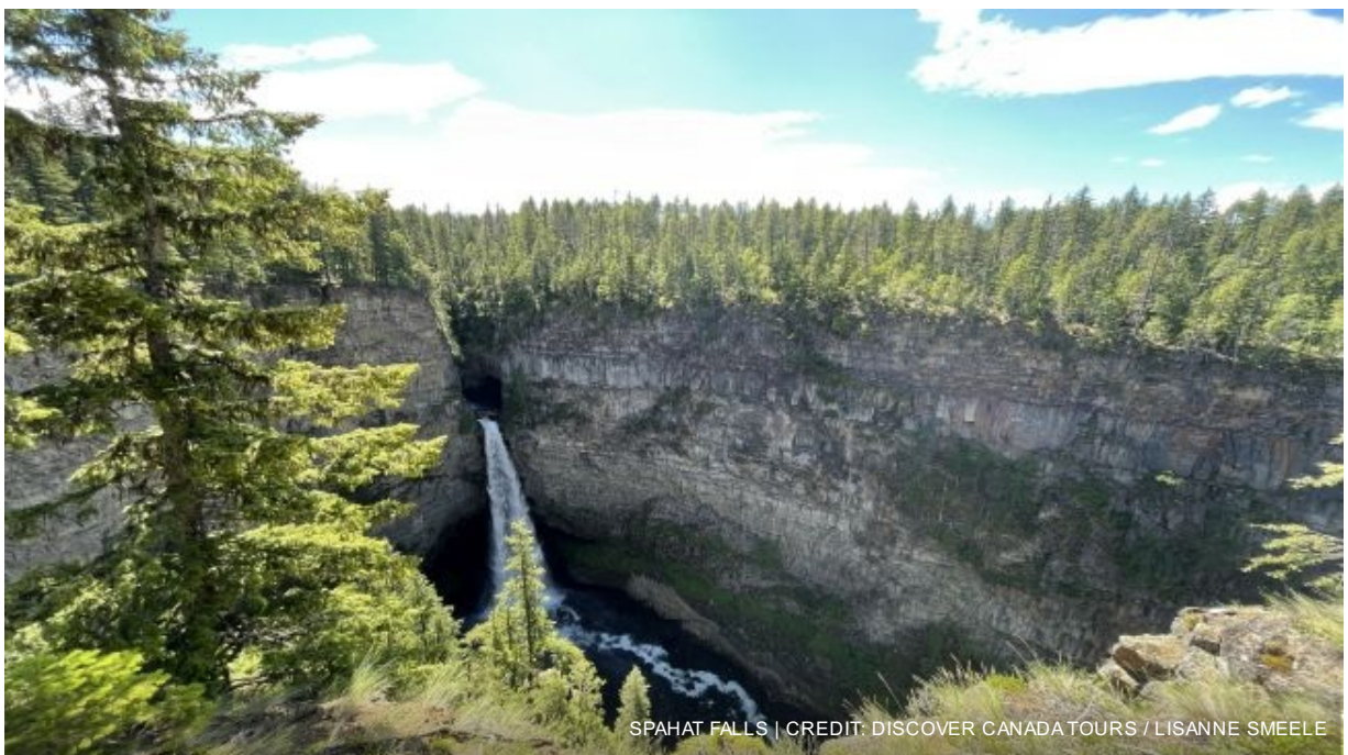
SPACHAT FALLS