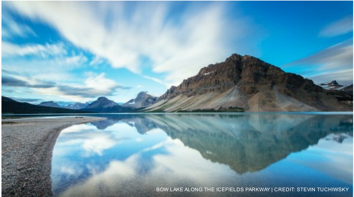
BOW LAKE ALONG THE ICEFIELDS PARKWAY