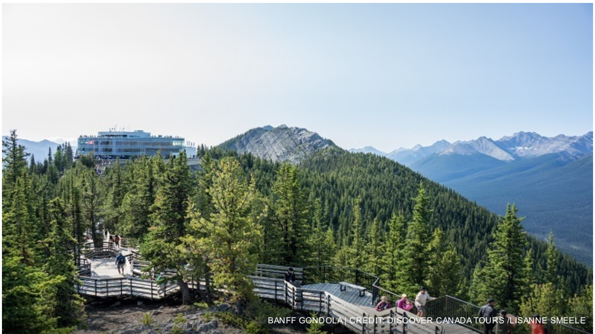
BANFF GONDOLA