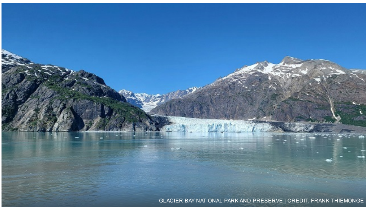
GLACIER BAY NATIONAL PARK AND PRESERVE