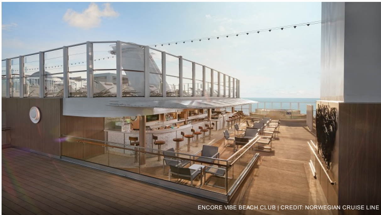
ENCORE VIBE BEACH CLUB

Sail to Glacier Bay National Park and Preserve, a United Nations World Heritage Site. Comprised of 3.3 million acres of natural wonders, it is home to magnificent glaciers, snow-capped mountains and abundant birds and wildlife. Take an Alaska cruise to experience the magnificent glaciers and wildlife at the Glacier Bay National Park and Preserve.