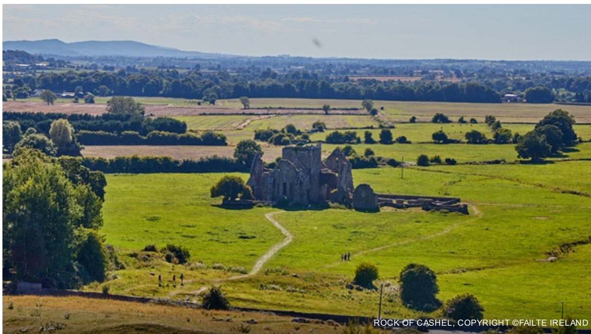
ROCK OF CASHEL

Embark on a city adventure this morning accompanied by your expert guide and driver.