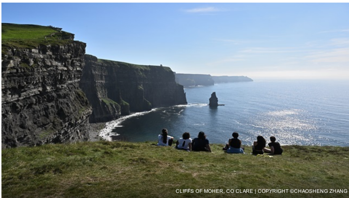
CLIFFS OF MOHER, CO CLARE