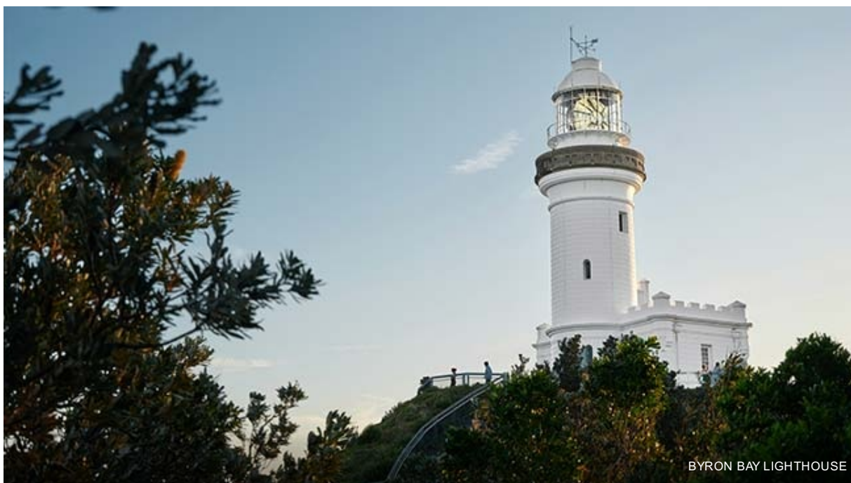
BYRON BAY LIGHTHOUSE