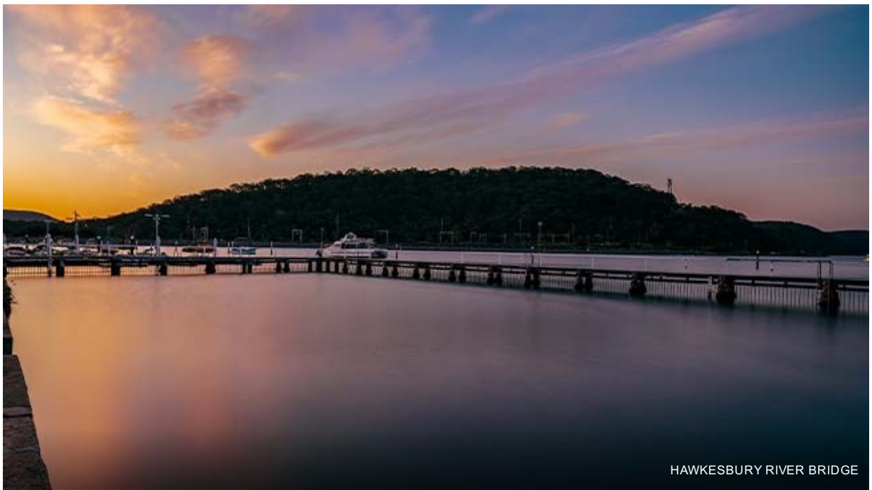
HAWKESBURY RIVER BRIDGE