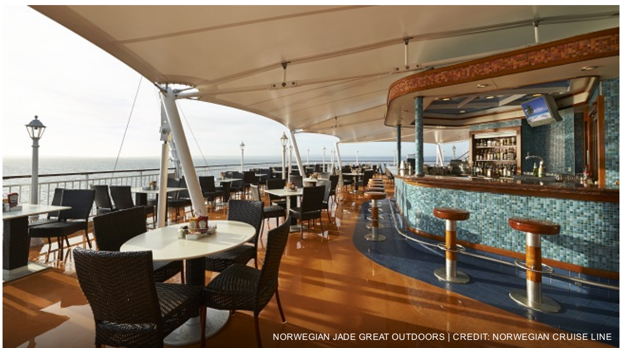
NORWEGIAN JADE GREAT OUTDOORS