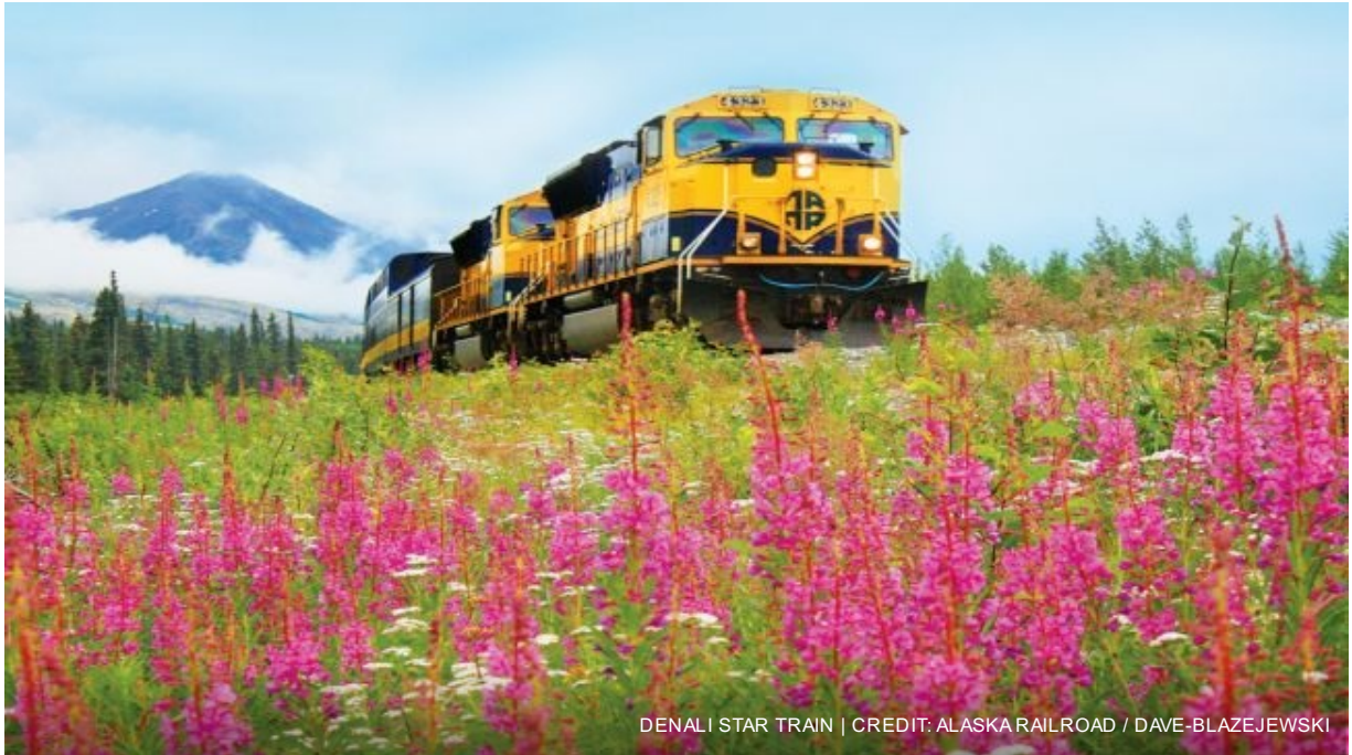
DENALI STAR TRAIN

Overnight in Anchorage at Clarion Suites Hotel (or similar)