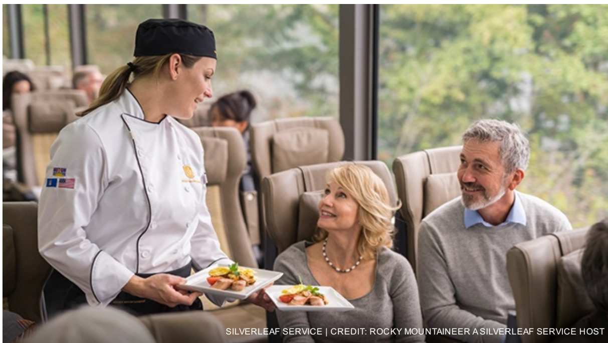
SILVERLEAF SERVICE A SILVERLEAF SERVICE HOST