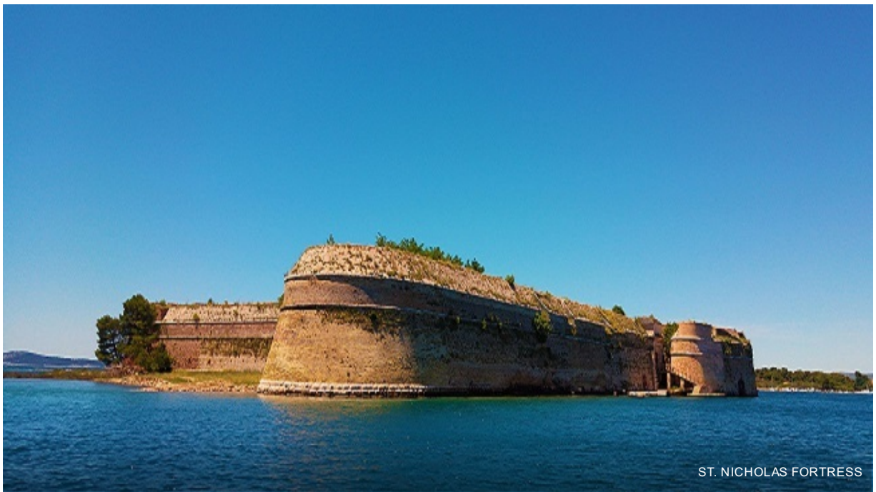
ST. NICHOLAS FORTRESS