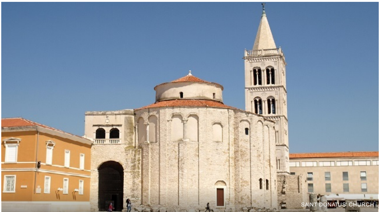
SAINT DONATUS' CHURCH