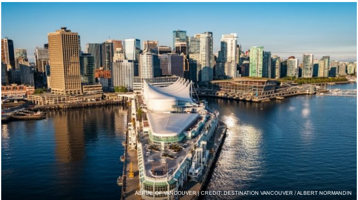
AERIAL OF VANCOUVER

Overnight in Vancouver at Sheraton Wall Centre