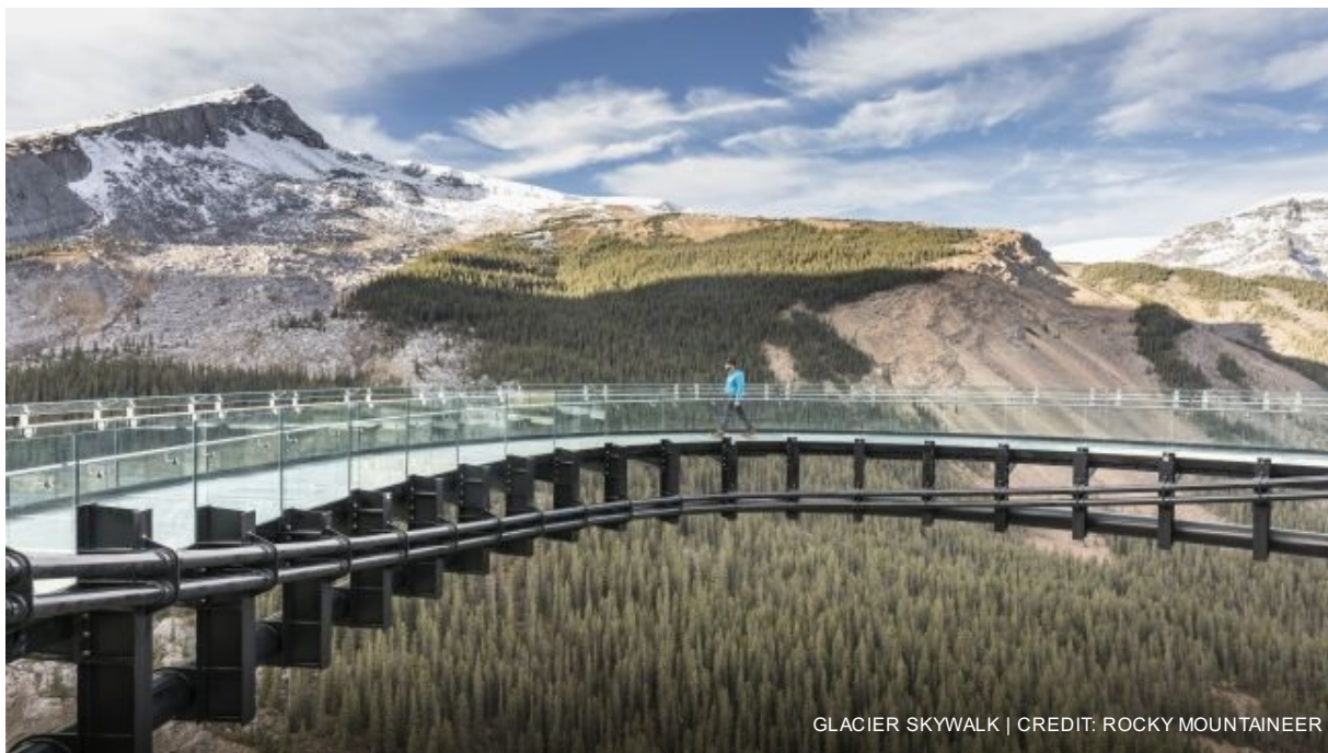
GLACIER SKYWALK