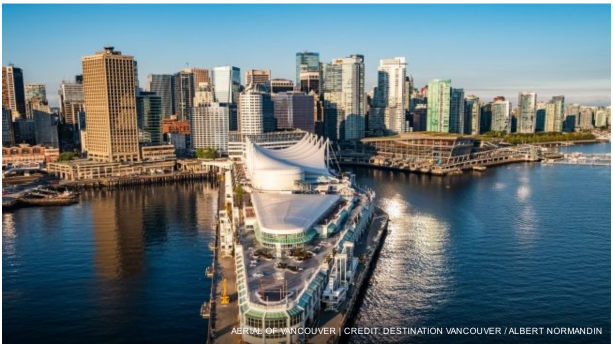
AERIAL OF VANCOUVER

Overnight in Vancouver at Sheraton Wall Centre