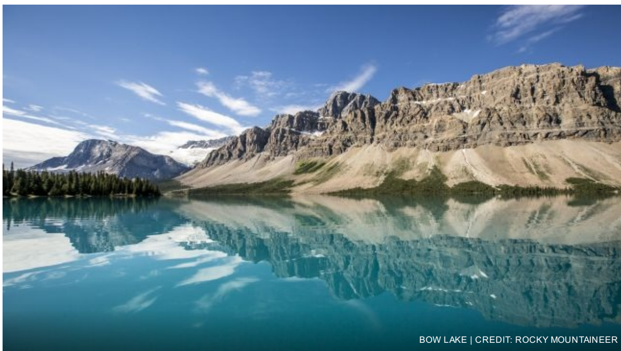
BOW LAKE

Overnight in Banff at Banff Caribou Lodge & Spa