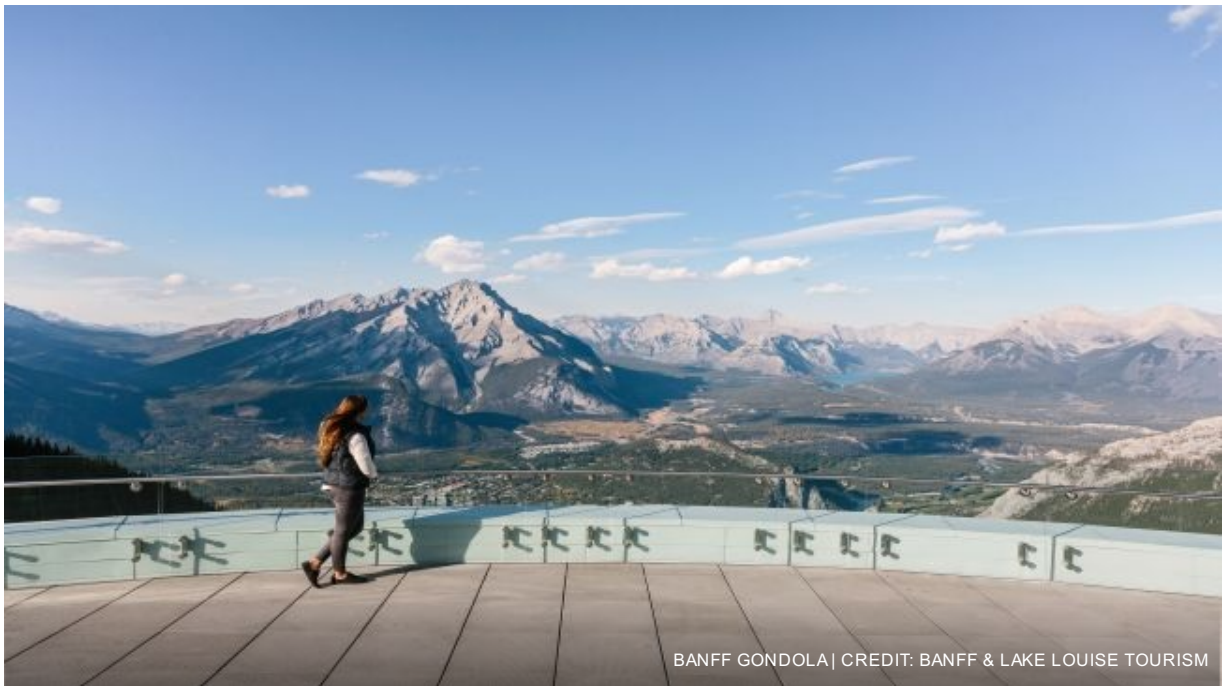
BANFF GONDOLA

Overnight in Calgary at the Delta Calgary Downtown