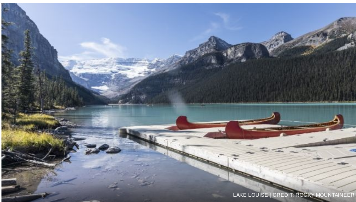
LAKE LOUISE

Overnight in Lake Louise at the Fairmont Chateau Lake Louise