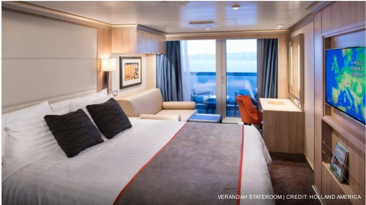
VERANDAH STATEROOM