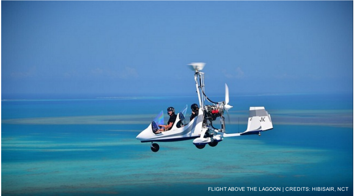
FLIGHT ABOVE THE LAGOON