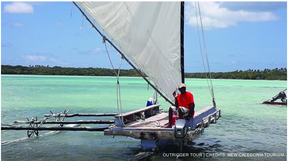
OUTRIGGER TOUR