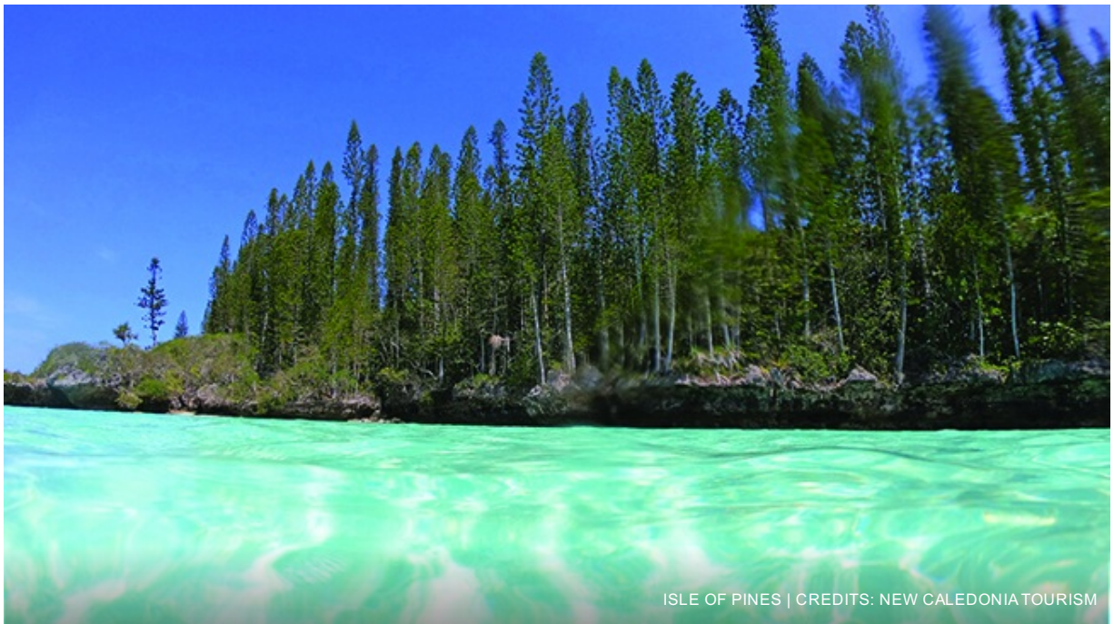
ISLE OF PINES