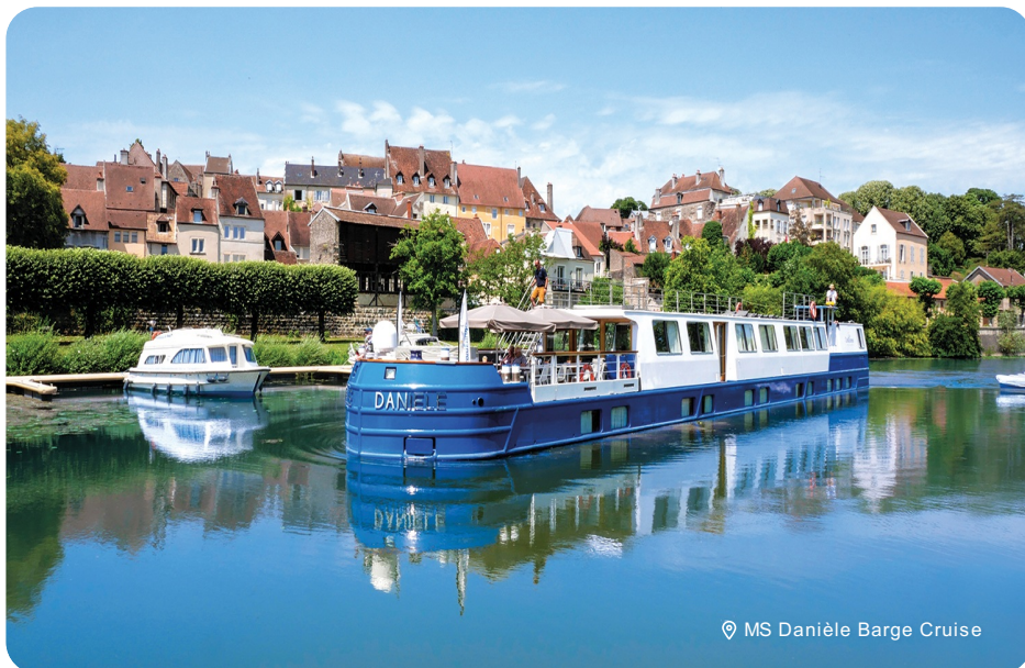
MS Danièle Barge Cruise