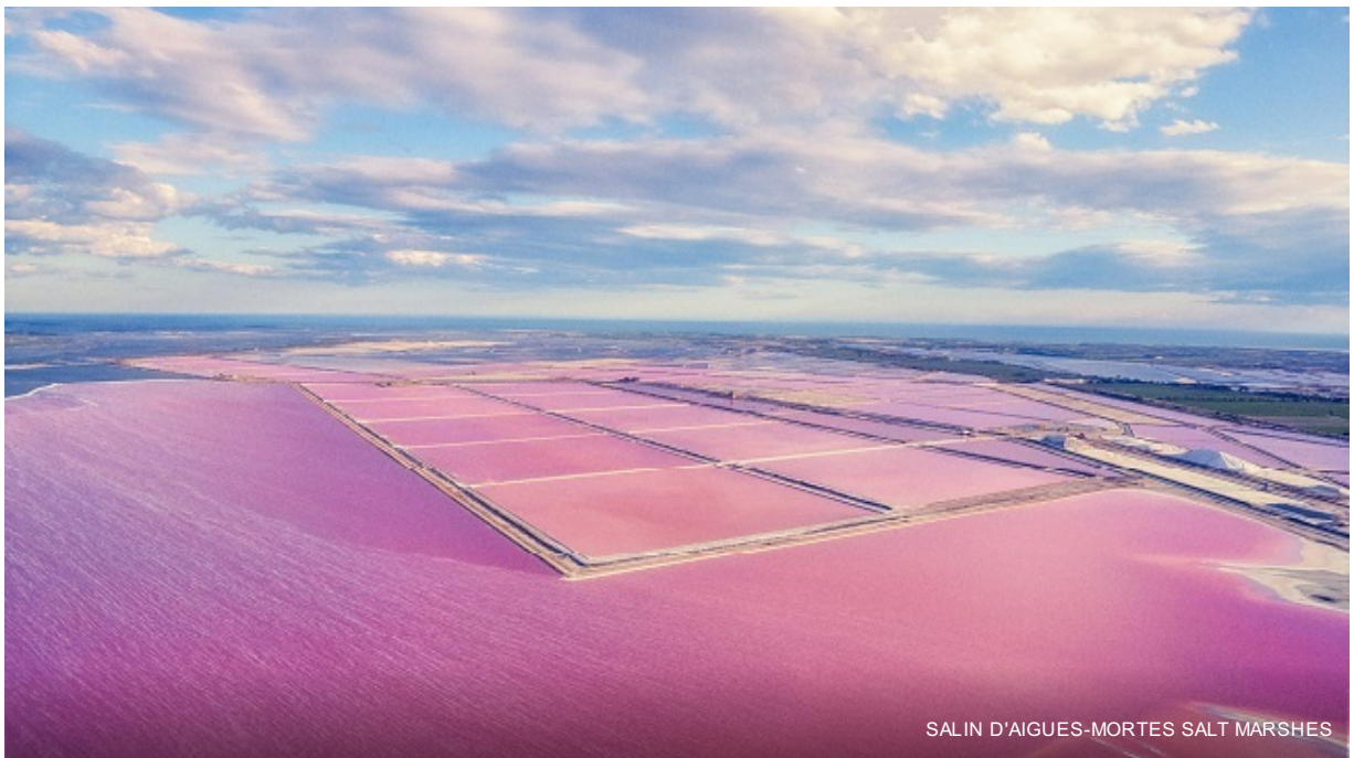
SALIN D'AIGUES-MORTES SALT MARSHES