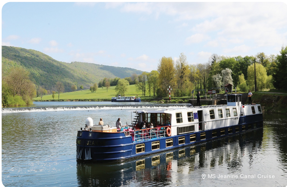
MS Jeanine Canal Cruise