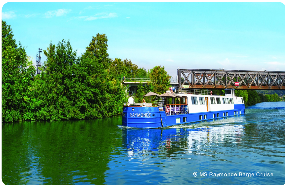
MS Raymonde Barge Cruise