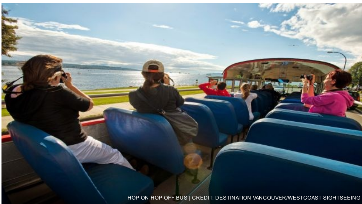
HOP ON HOP OFF BUS

Overnight in Vancouver at the Sheraton Vancouver Wall Centre