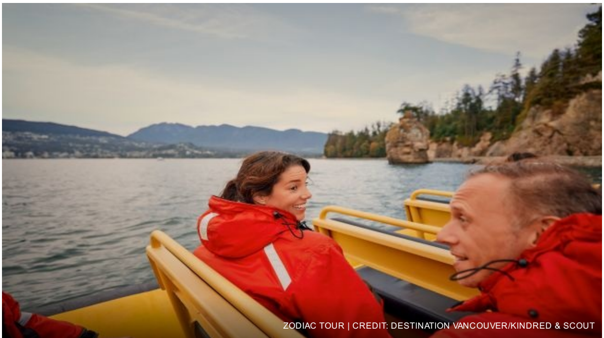
ZODIAC TOUR

Overnight in Vancouver at the Sheraton Vancouver Wall Centre