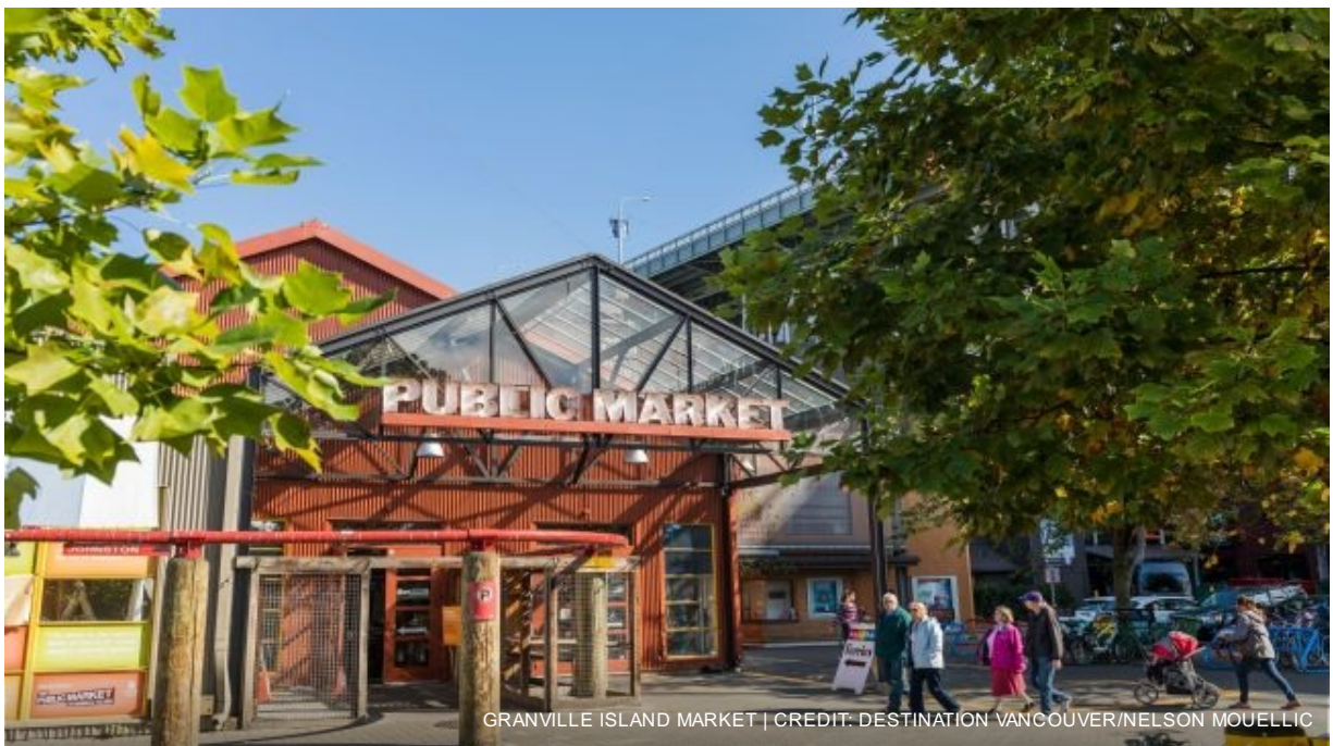
GRANVILLE ISLAND MARKET