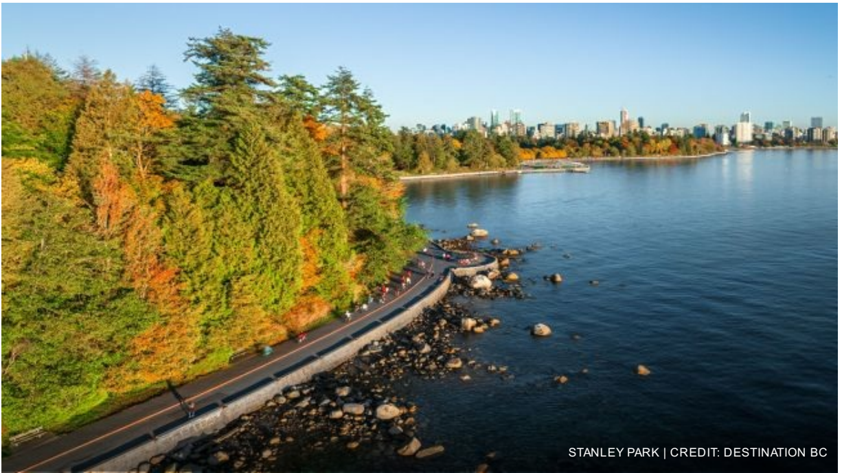
STANLEY PARK