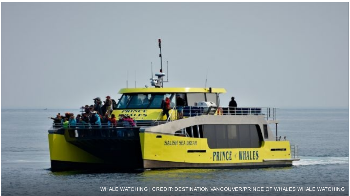
WHALE WATCHING

Overnight in Vancouver at the Rosedale on Robson Suite Hotel