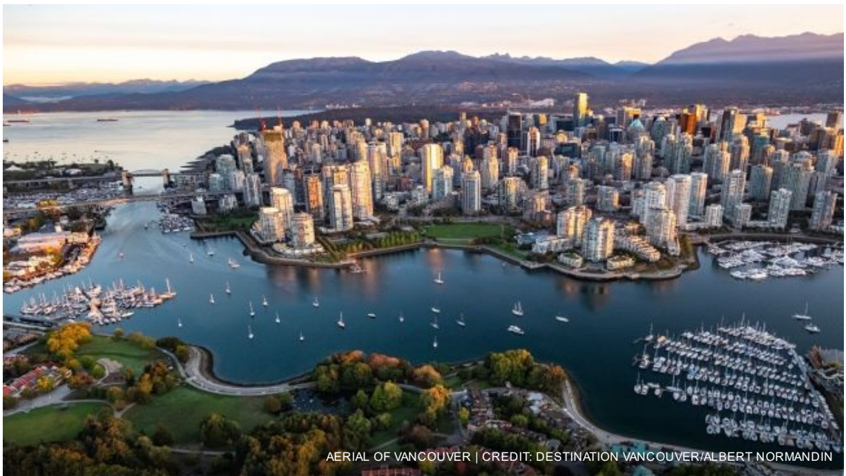
AERIAL OF VANCOUVER