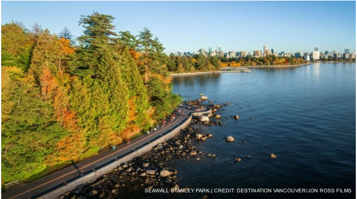
SEAWALL STANLEY PARK

Overnight in Vancouver at the Rosedale on Robson Suite Hotel