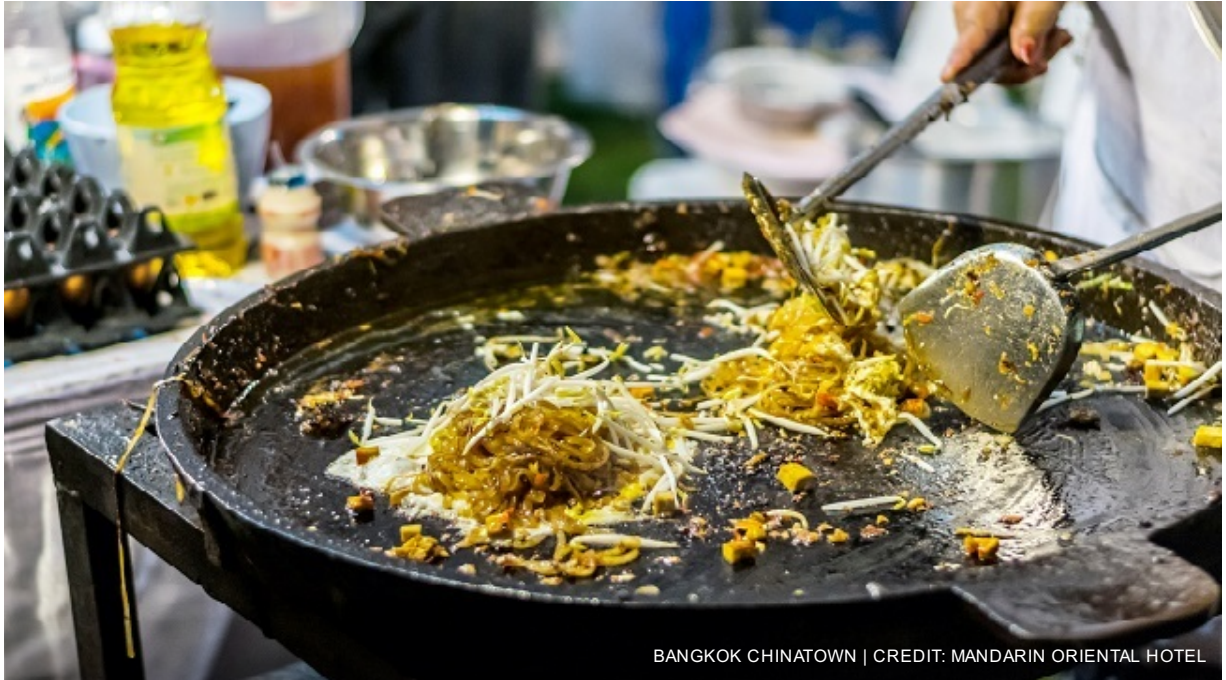
BANGKOK CHINATOWN