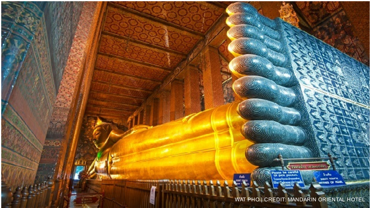
WAT PHO