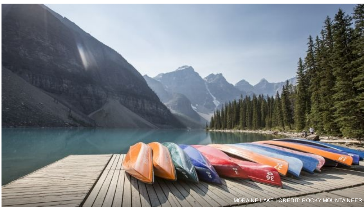
MORAINE LAKE