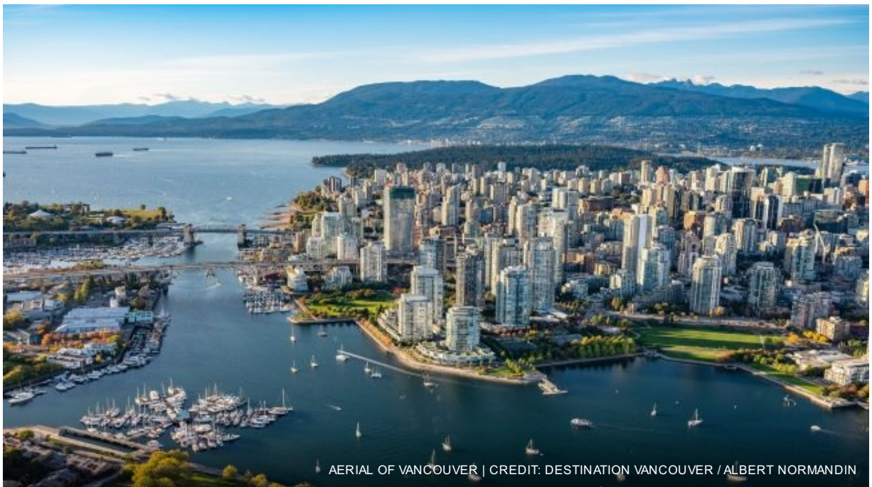
AERIAL OF VANCOUVER

Please Note: 05th July 2026 departure includes only 3-Nights in Vancouver and therefore this night would not be included on this particular departure date.