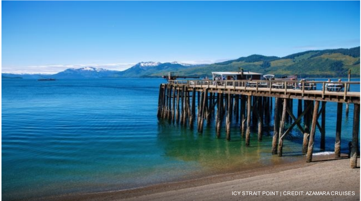
ICY STRAIT POINT