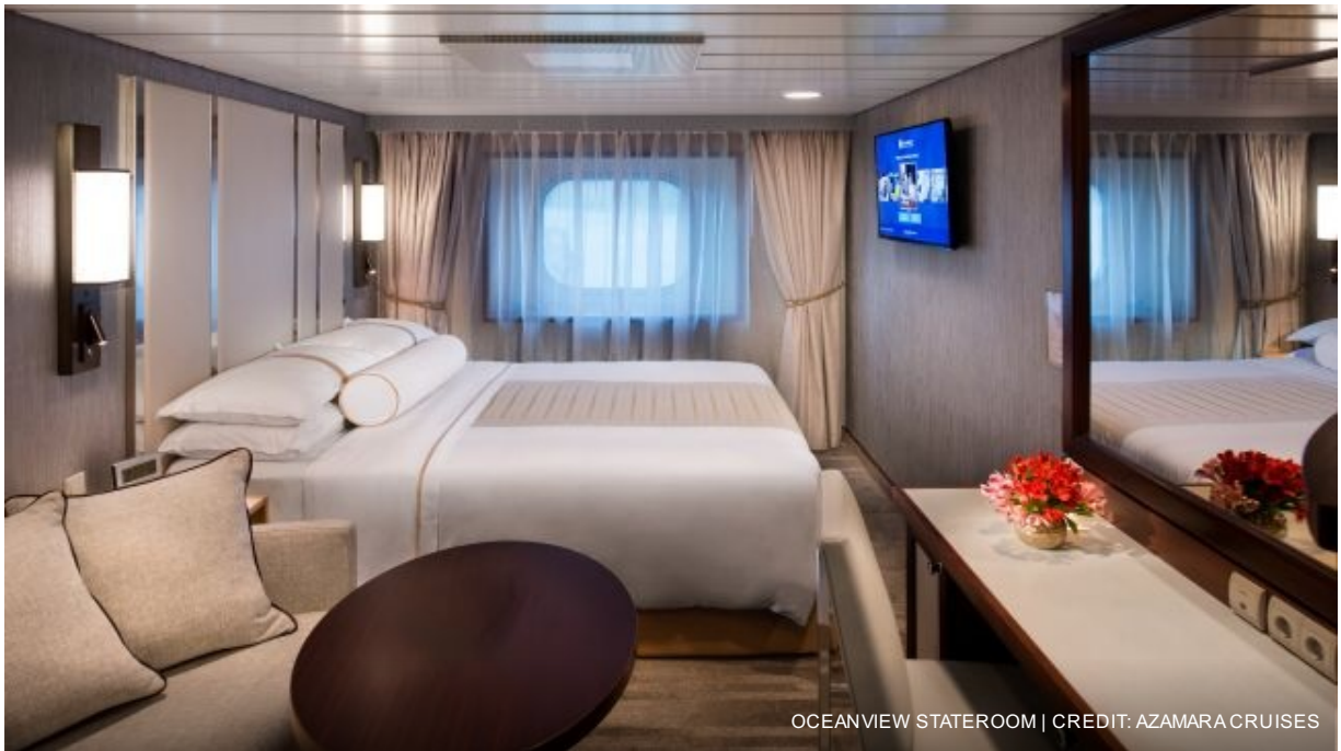
OCEANVIEW STATEROOM