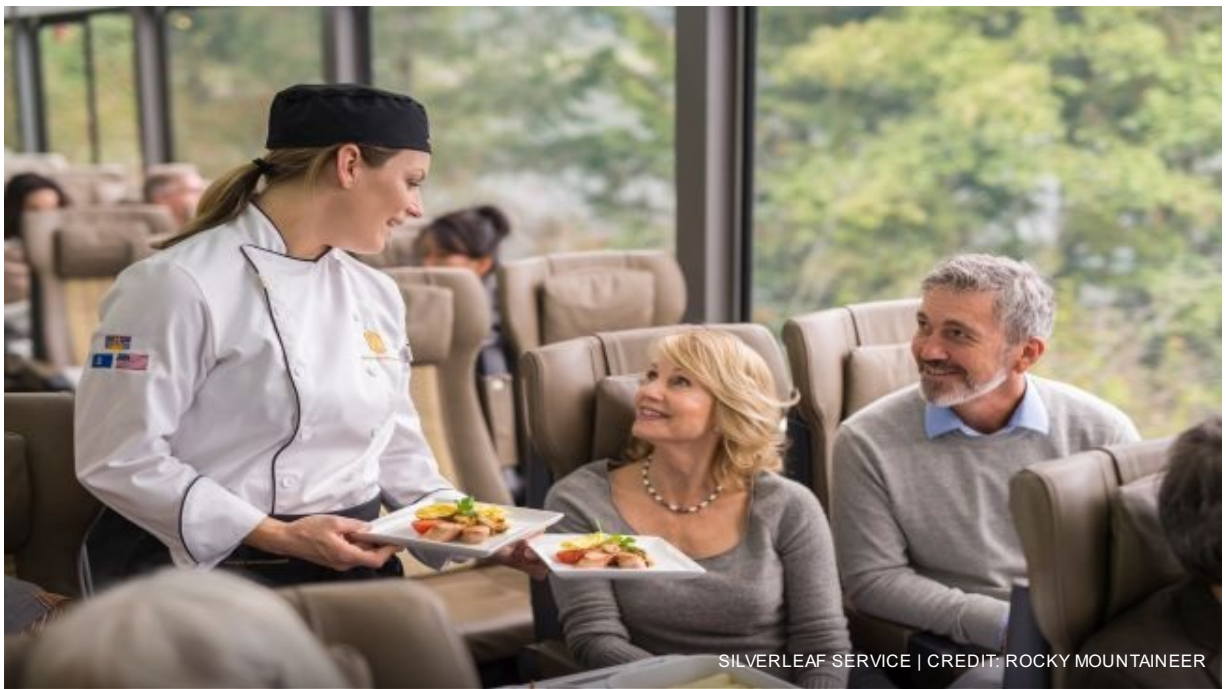
SILVERLEAF SERVICE