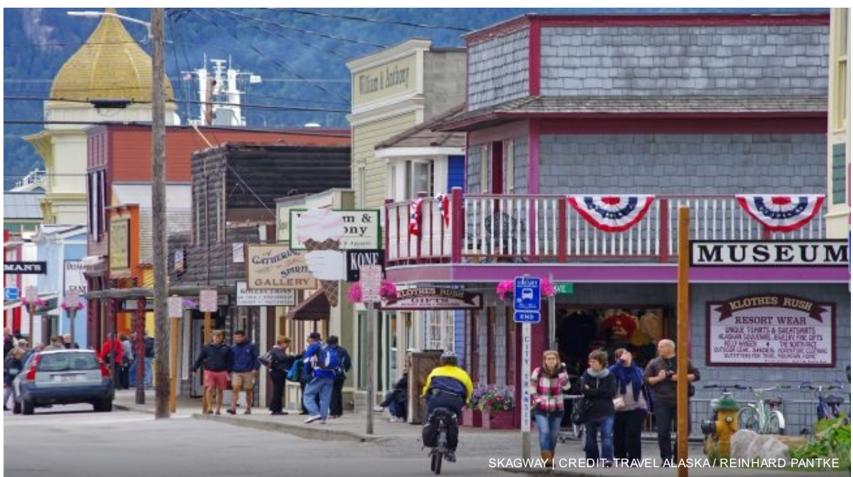
SKAGWAY | CREDIT: TRAVEL ALASKA / REINHARD PANTKE