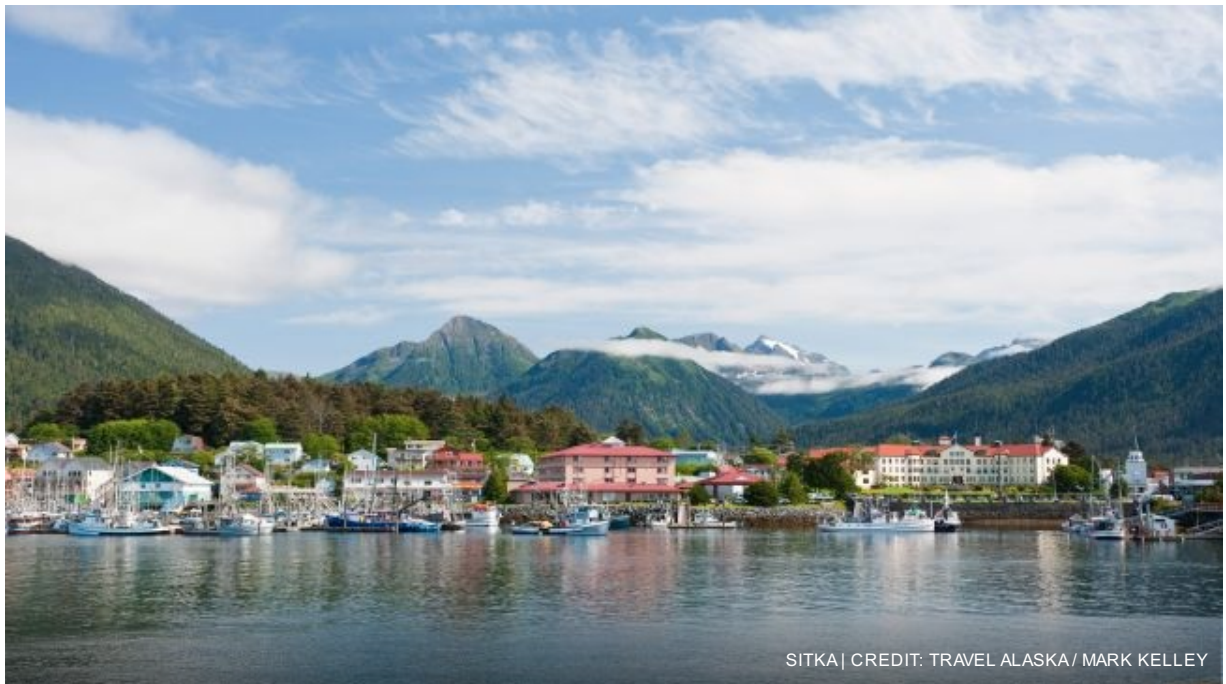
SITKA