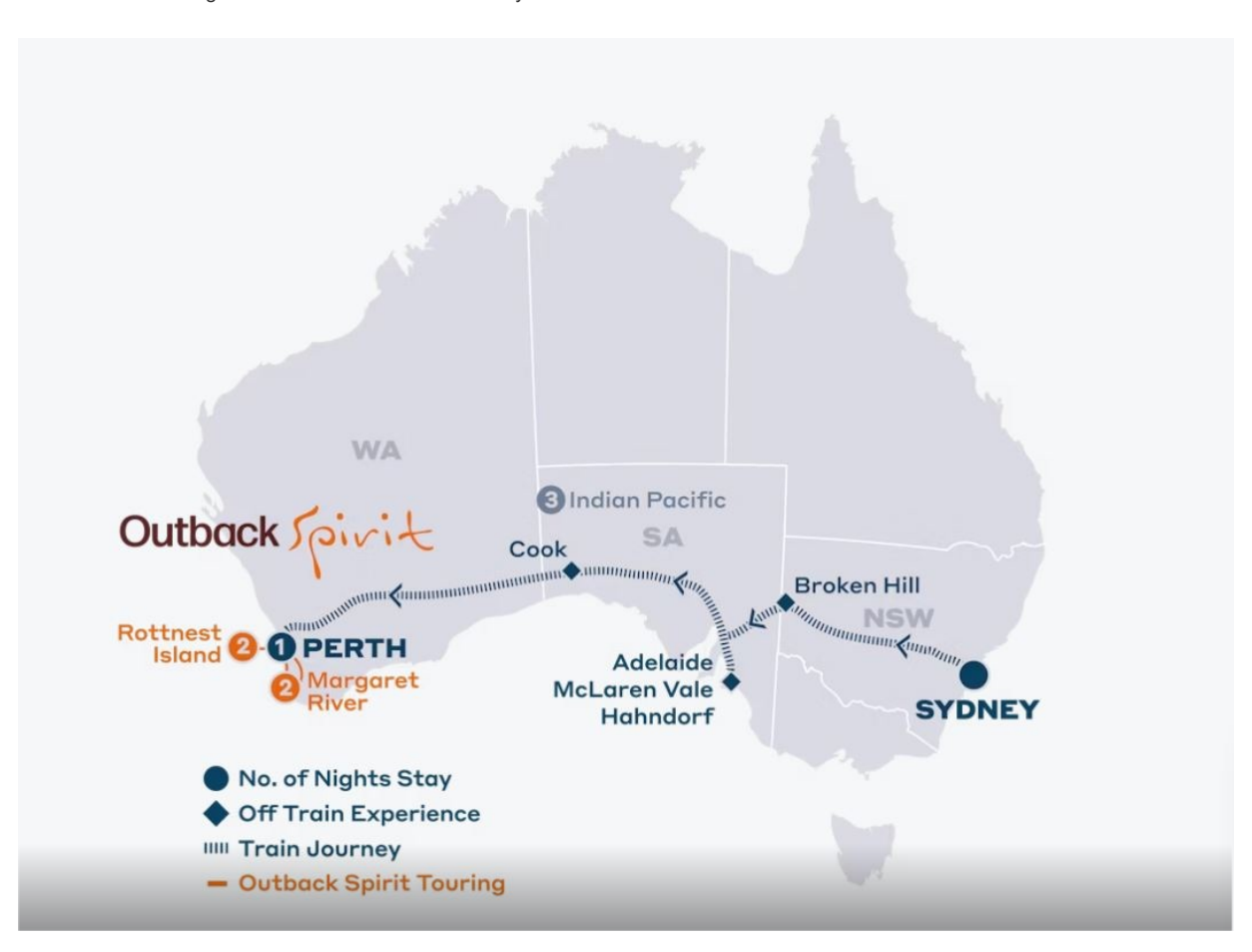
Indian Pacific - Margaret River & Rottnest Discovery