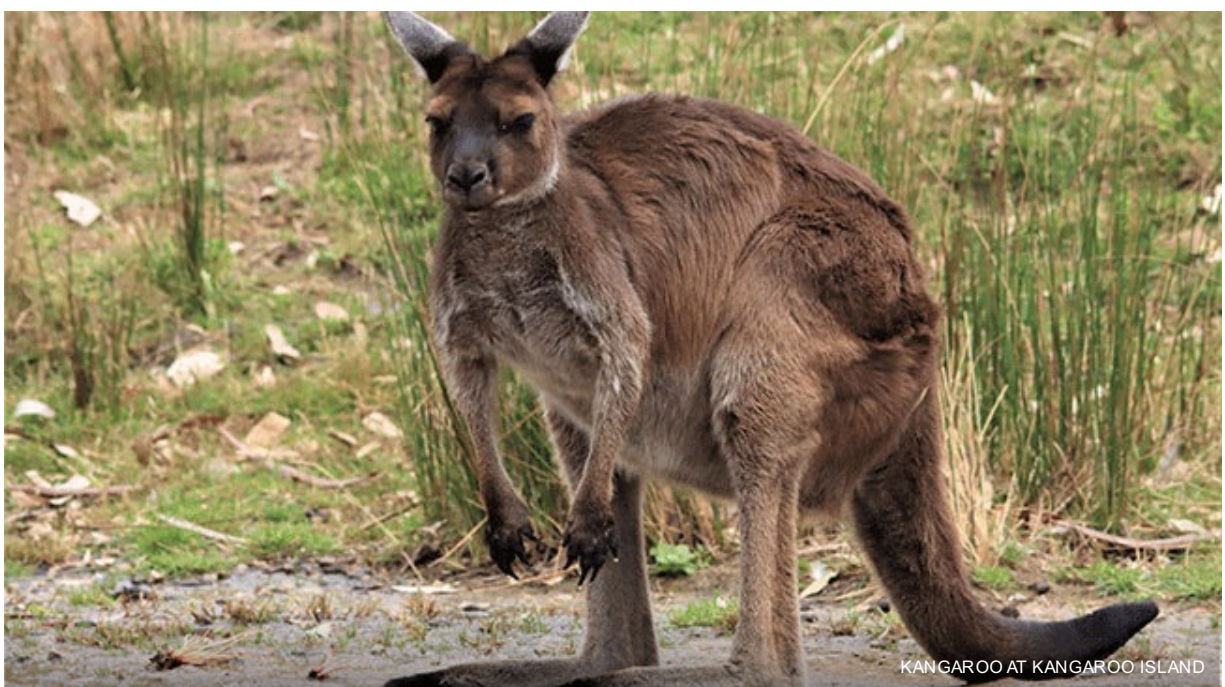
KANGAROO AT KANGAROO ISLAND