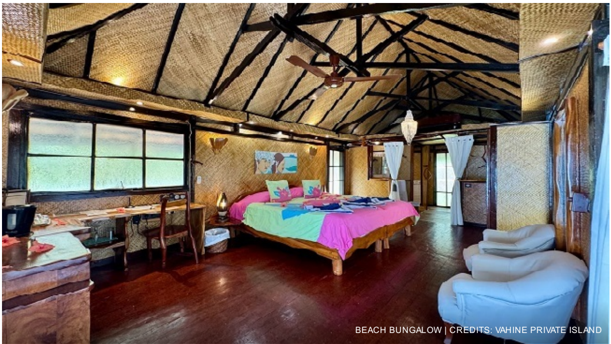
BEACH BUNGALOW