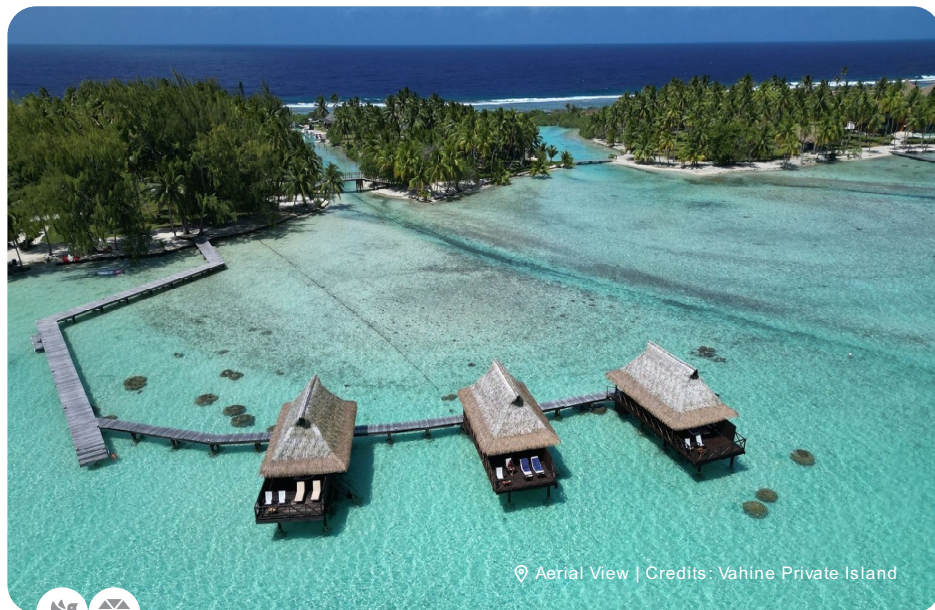
Aerial View