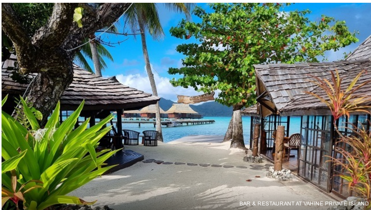
BAR & RESTAURANT AT VAHINE PRIVATE ISLAND