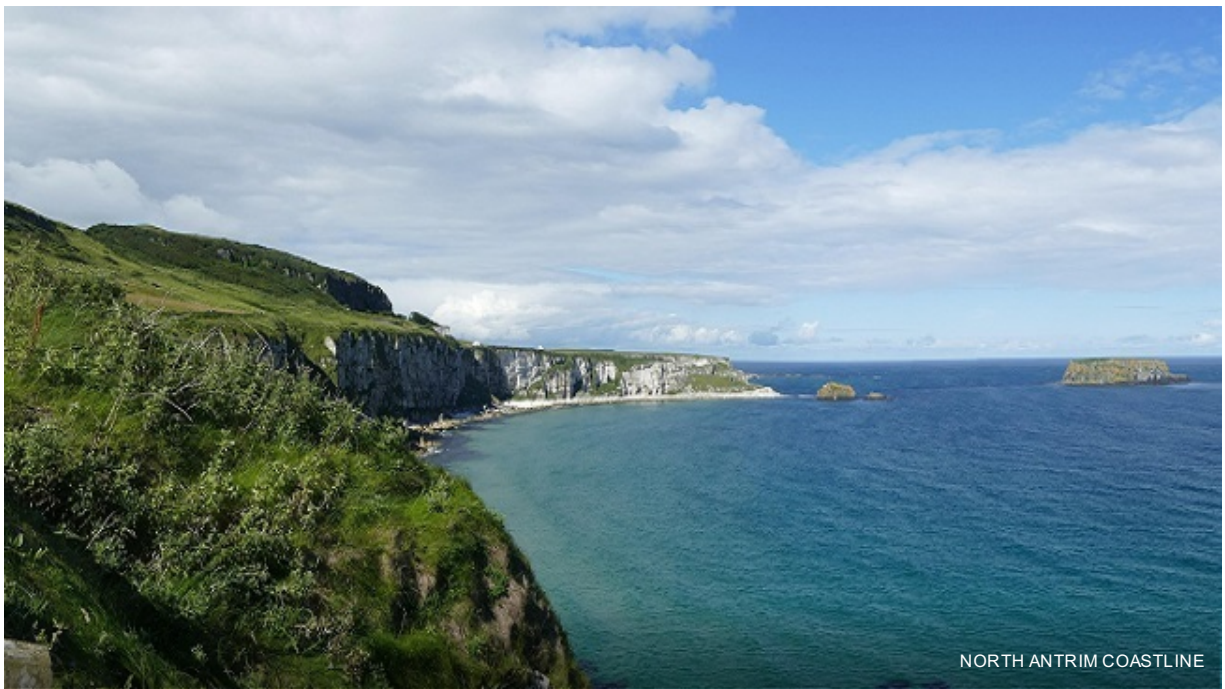
NORTH ANTRIM COASTLINE