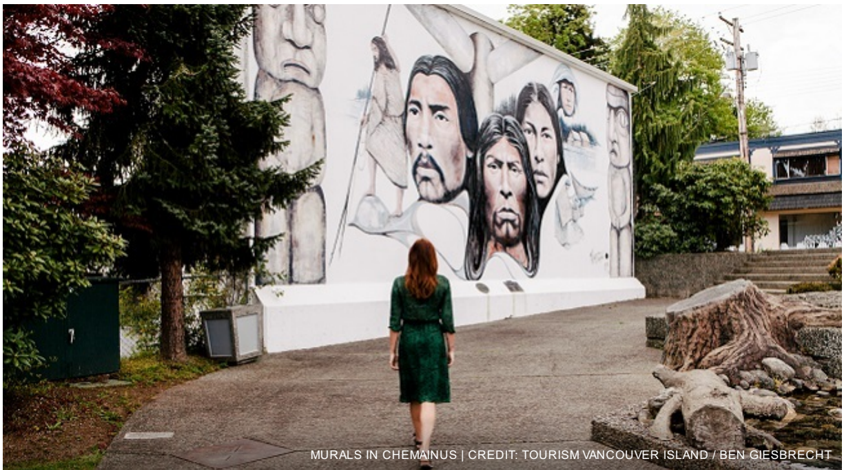
MURALS IN CHEMAINUS

Overnight in Victoria at Inn at Laurel Point (or similar)