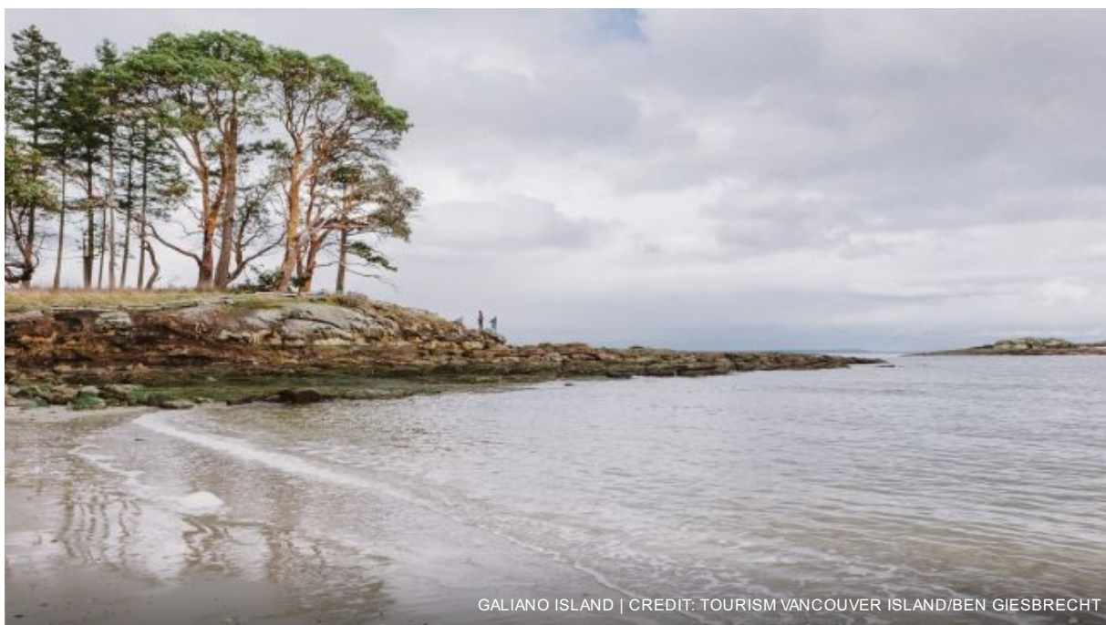
GALIANO ISLAND

Overnight in Galiano Island at Galiano Oceanfront Inn & Spa