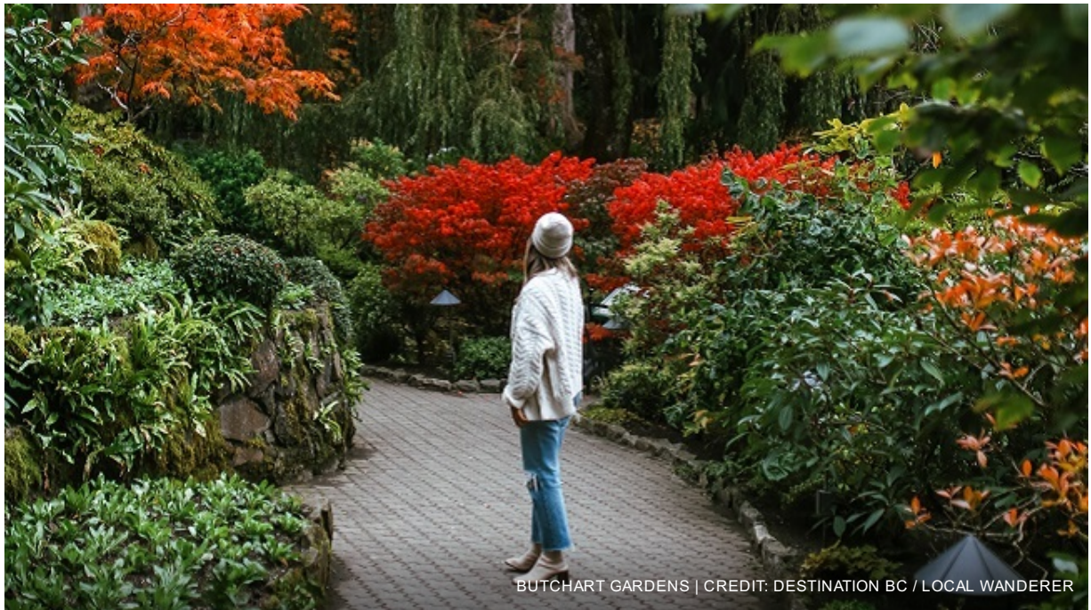
BUTCHART GARDENS

Overnight in Victoria at Inn at Laurel Point (or similar)