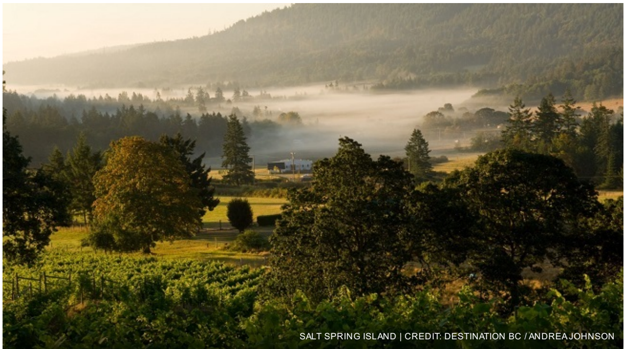
SALT SPRING ISLAND | CREDIT: DESTINATION BC / ANDREA JOHNSON

Overnight in Salt Spring Island at Harbour House Hotel