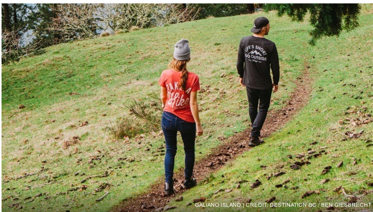
GALIANO ISLAND | CREDIT: DESTINATION BC / BEN GIESBRECHT

Overnight in Galiano Island at Galiano Oceanfront Inn & Spa