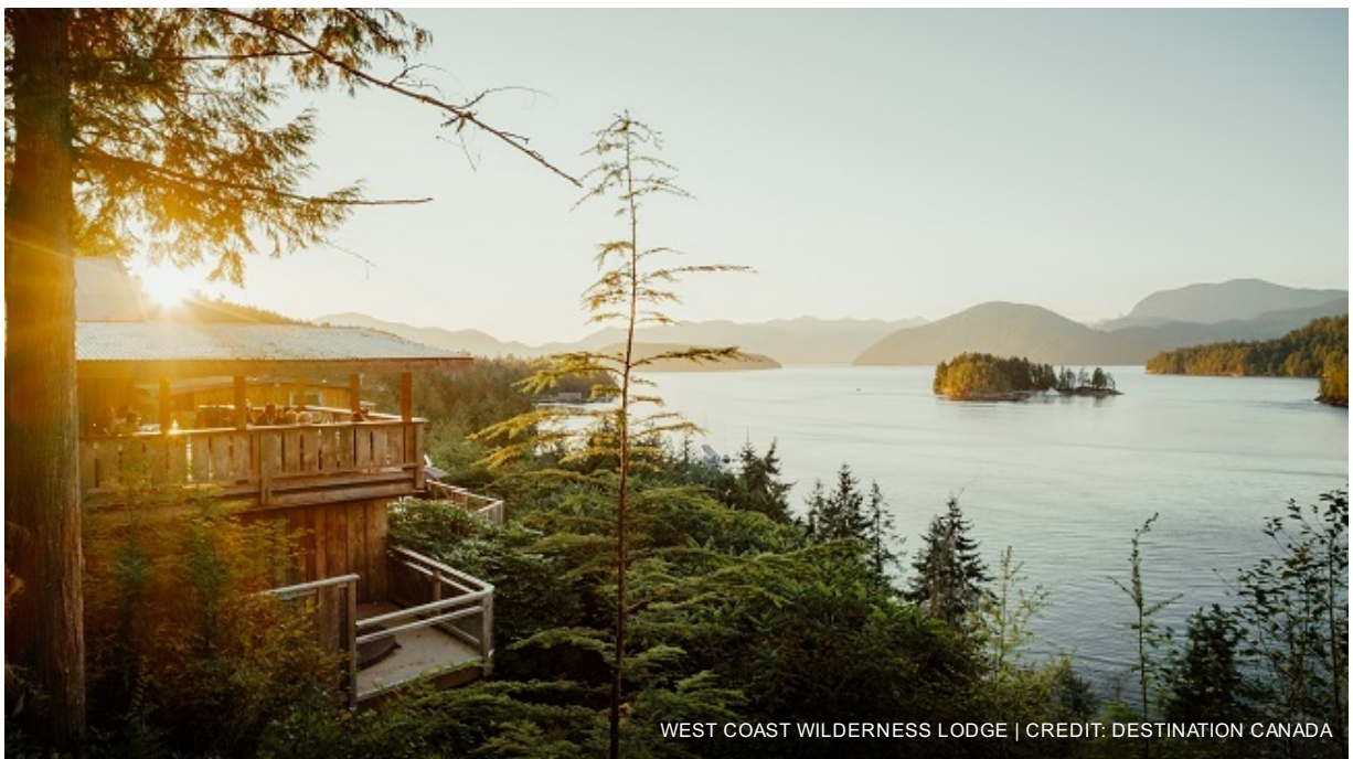
WEST COAST WILDERNESS LODGE

Overnight in Egmont at West Coast Wilderness Lodge