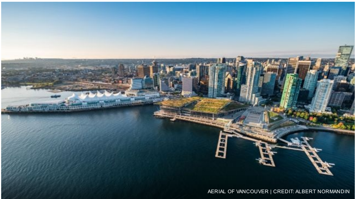
AERIAL OF VANCOUVER