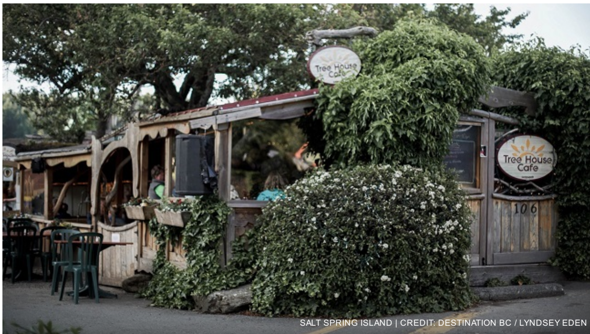
SALT SPRING ISLAND

Overnight in Salt Spring Island at Harbour House Hotel