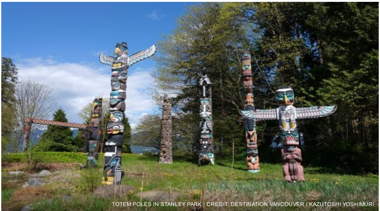
TOTEM POLES IN STANLEY PARK

Overnight in Vancouver at Sheraton Vancouver Wall Centre Hotel (or similar)