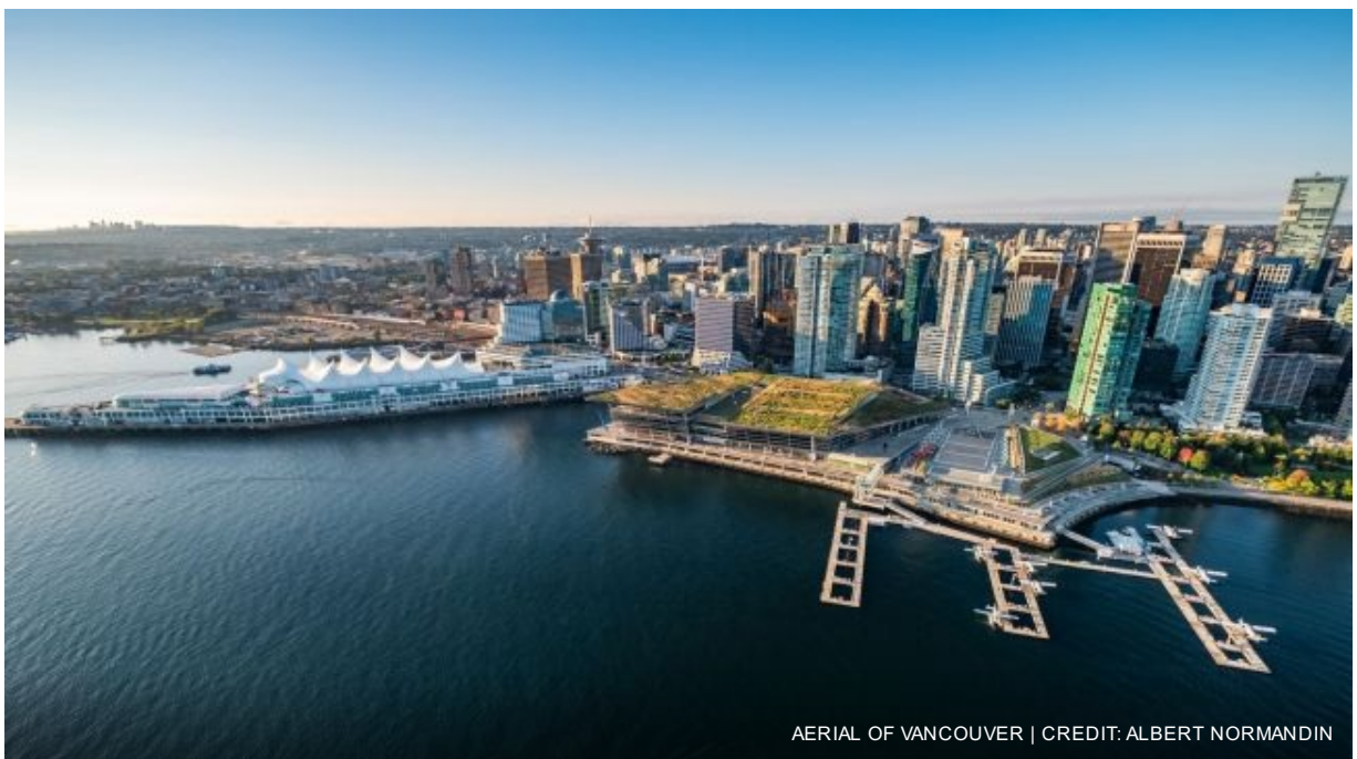
AERIAL OF VANCOUVER

Overnight in Vancouver at Sheraton Vancouver Wall Centre Hotel (or similar)