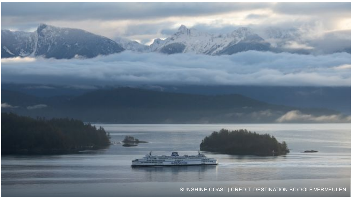
SUNSHINE COAST