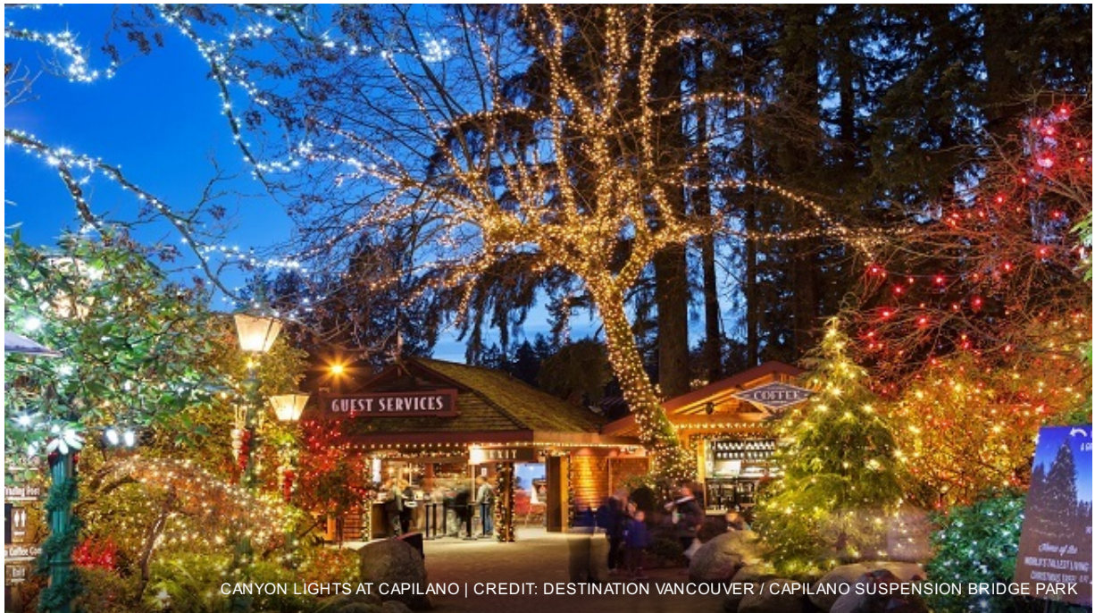
CANYON LIGHTS AT CAPILANO

Overnight in Vancouver at Sutton Place Hotel