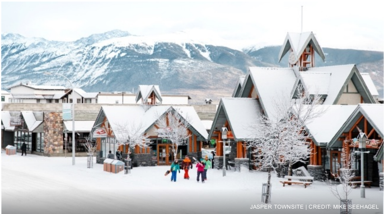
JASPER TOWNSITE