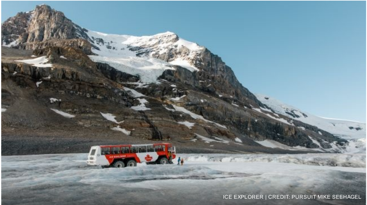
ICE EXPLORER