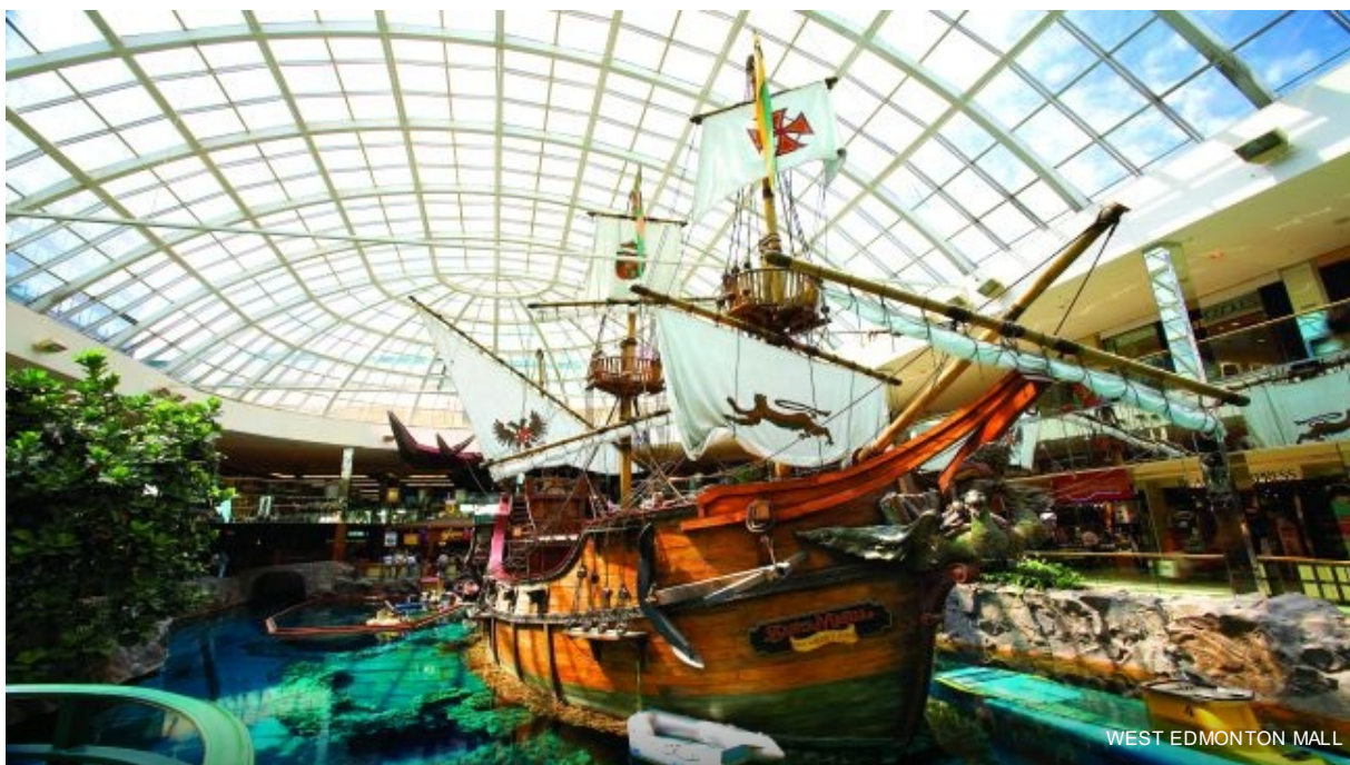
WEST EDMONTON MALL

Overnight in Edmonton at Fairmont Hotel MacDonald