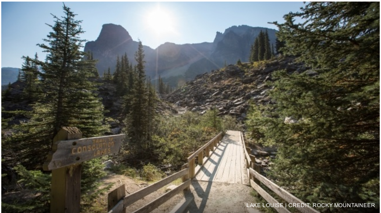
LAKE LOUISE

Overnight in Lake Louise at Fairmont Chateau Lake Louise