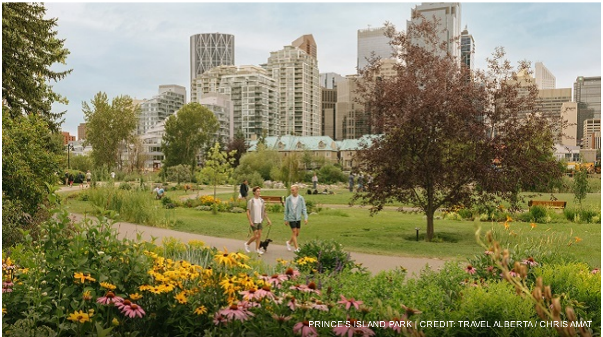
PRINCE'S ISLAND PARK

Overnight in Calgary at Delta Calgary Downtown