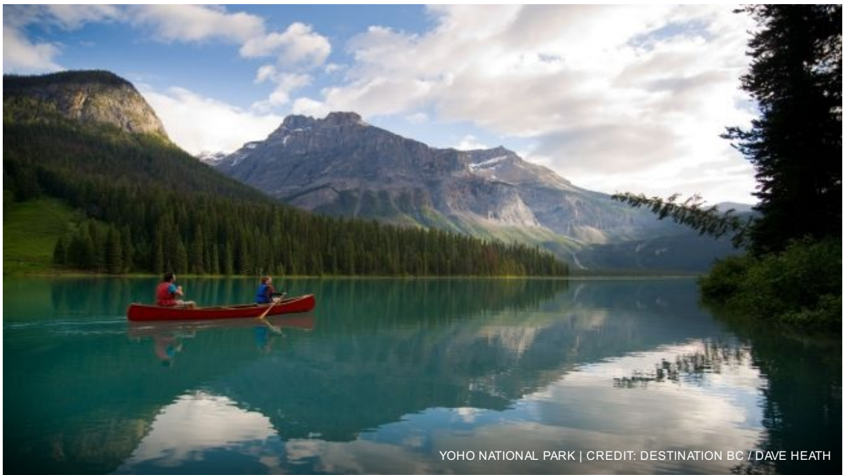
YOHO NATIONAL PARK