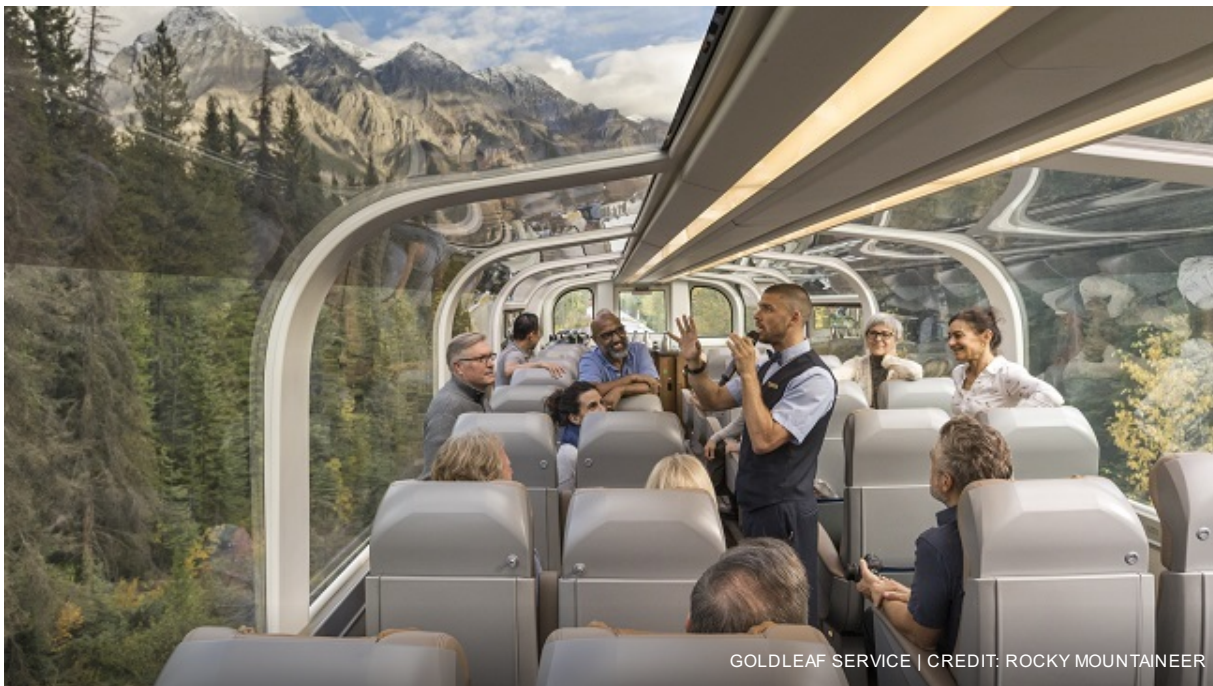
GOLDLEAF SERVICE