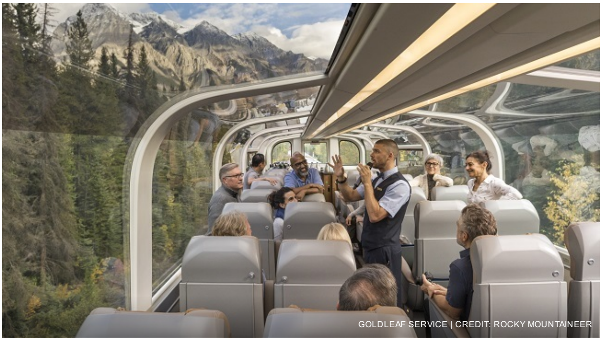
GOLDLEAF SERVICE