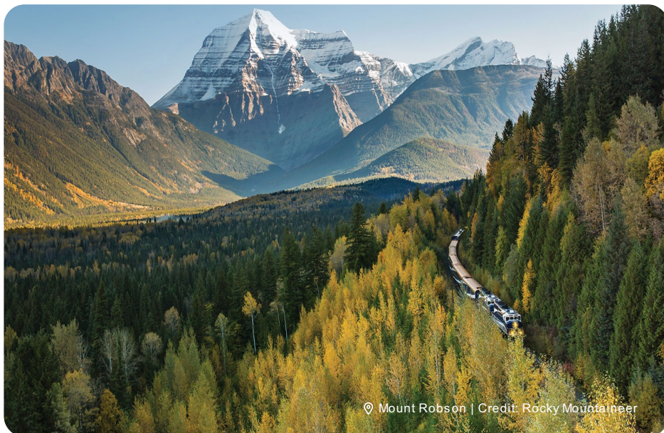
📍 Mount Robson