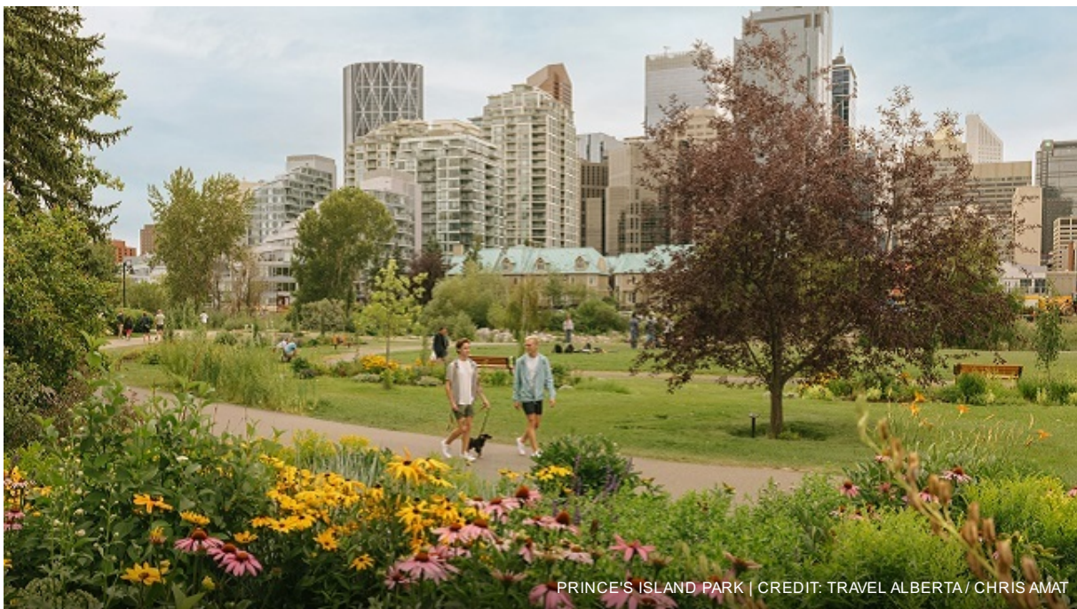
PRINCE'S ISLAND PARK

Overnight in Calgary at Delta Calgary Downtown