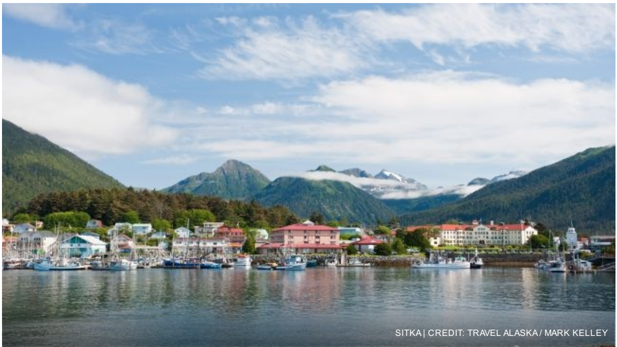
SITKA