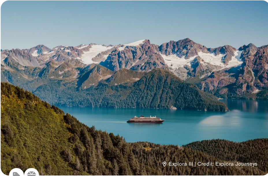
📍 Explora III