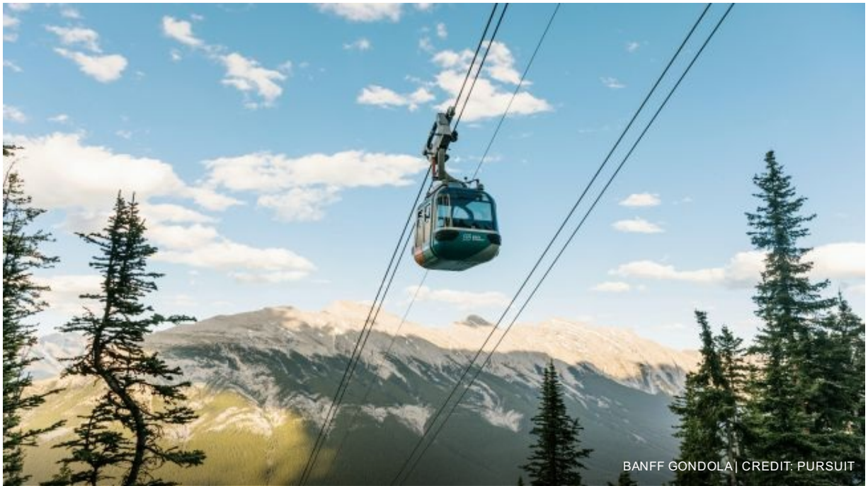
BANFF GONDOLA