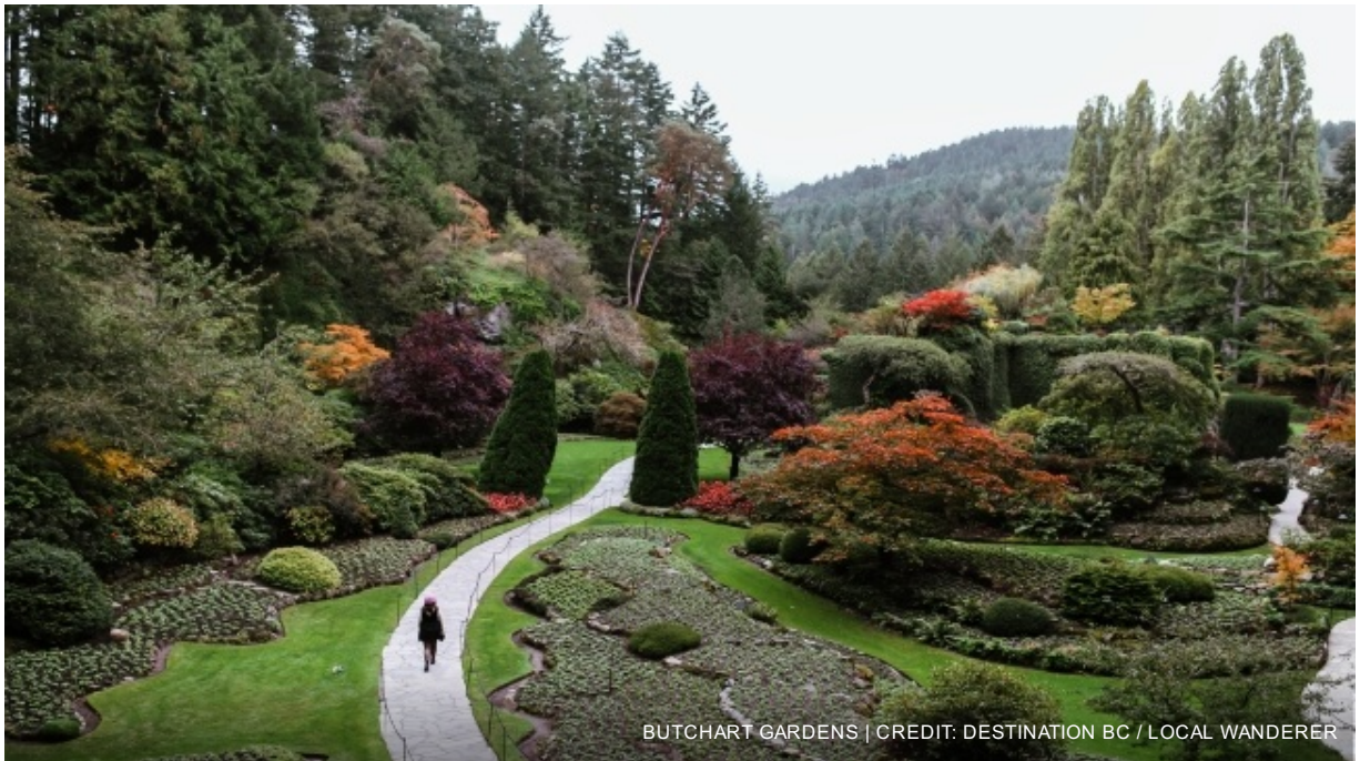
BUTCHART GARDENS

Overnight in Victoria at Inn at Laurel Point