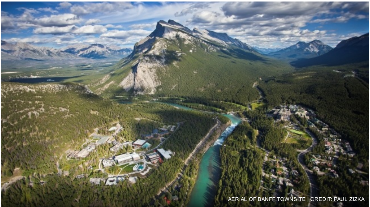
AERIAL OF BANFF TOWNSITE

Overnight in Banff at the Rimrock Resort