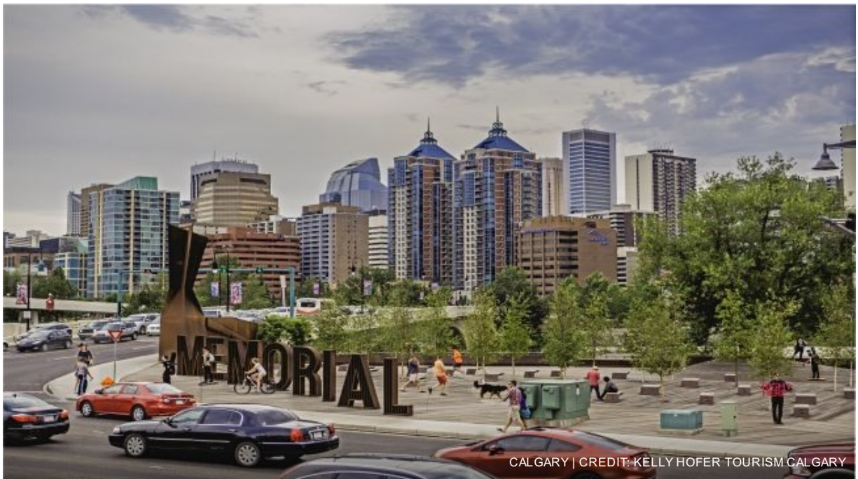
CALGARY

Overnight in Calgary at the Fairmont Palliser