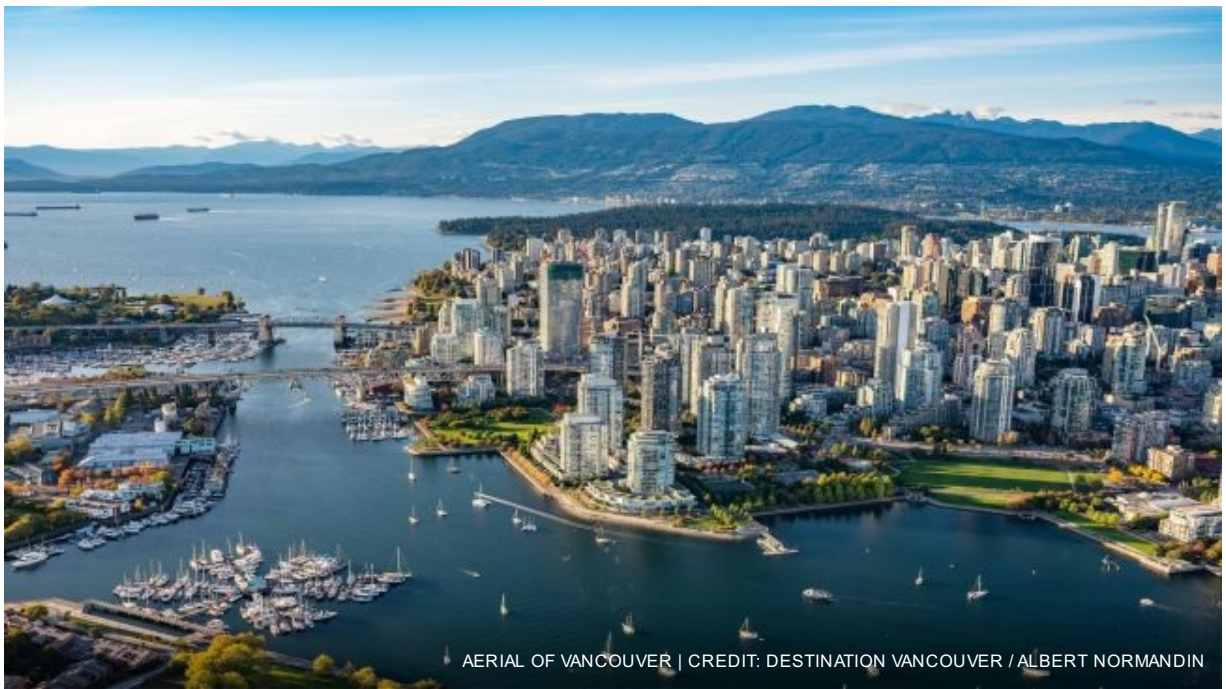
AERIAL OF VANCOUVER