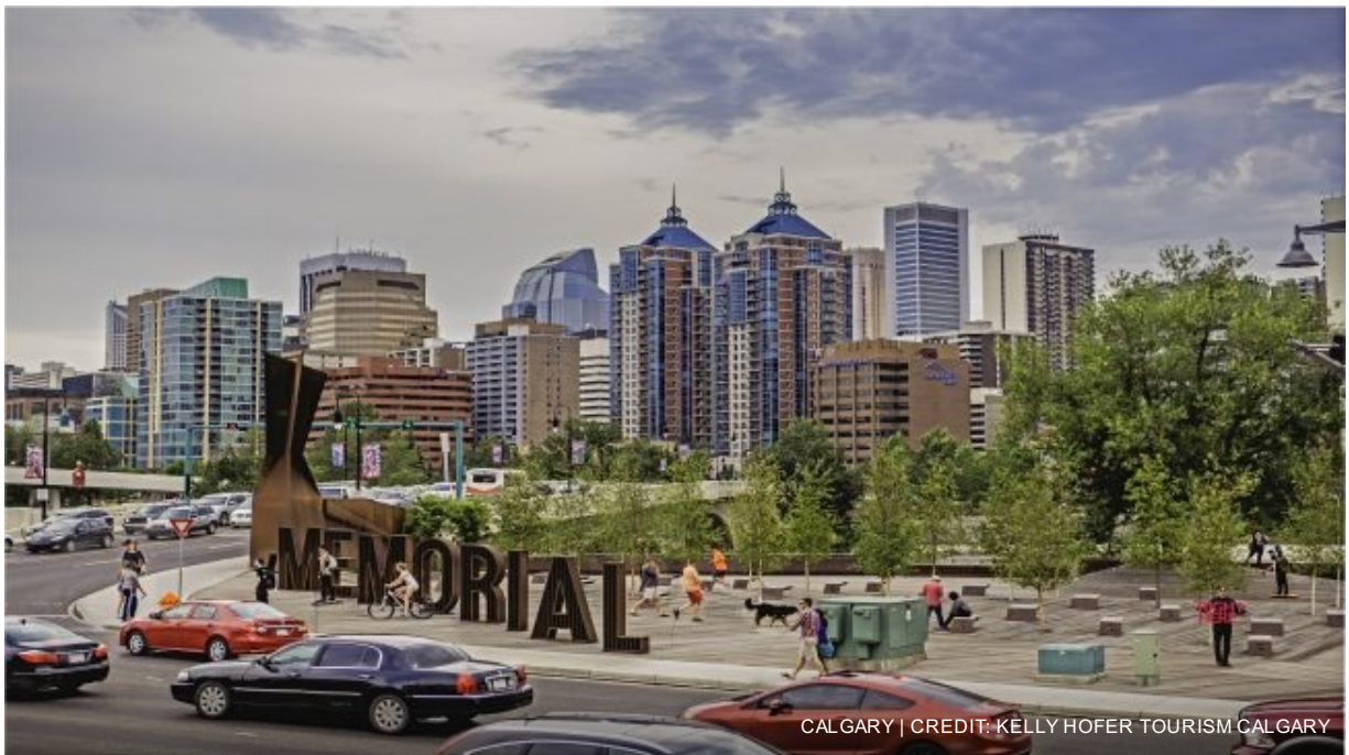
CALGARY

Overnight in Calgary at the Fairmont Palliser