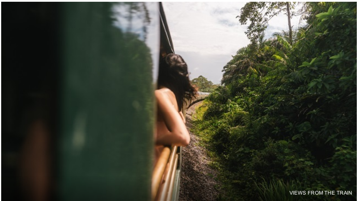
VIEWS FROM THE TRAIN