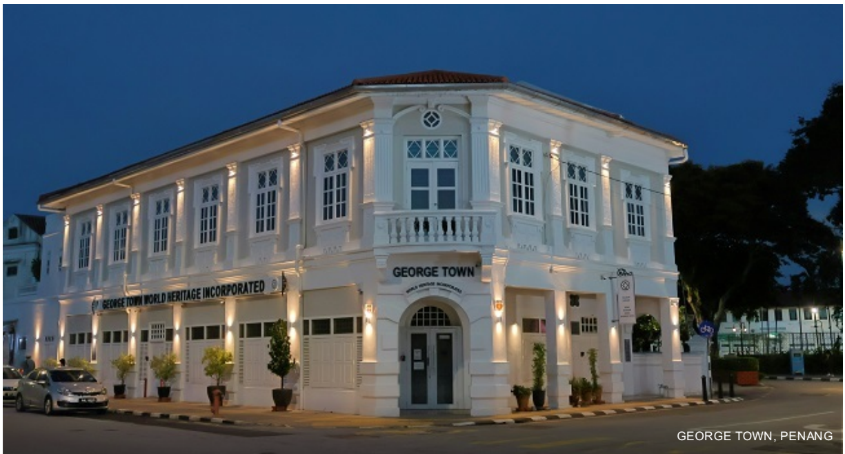
GEORGE TOWN, PENANG