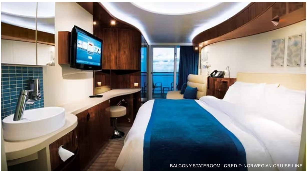
BALCONY STATEROOM