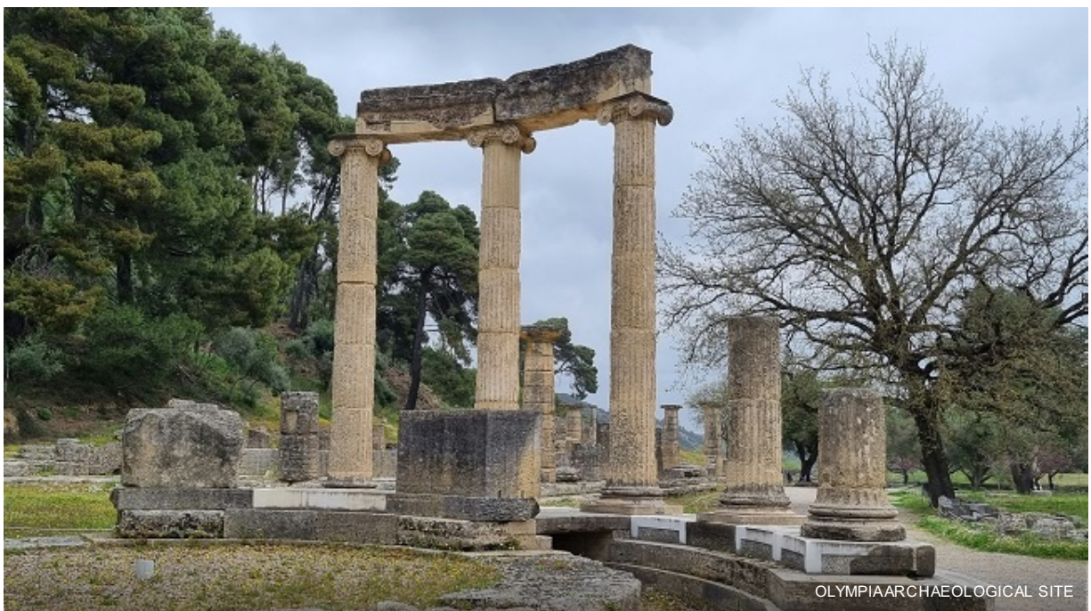
OLYMPIA ARCHAEOLOGICAL SITE