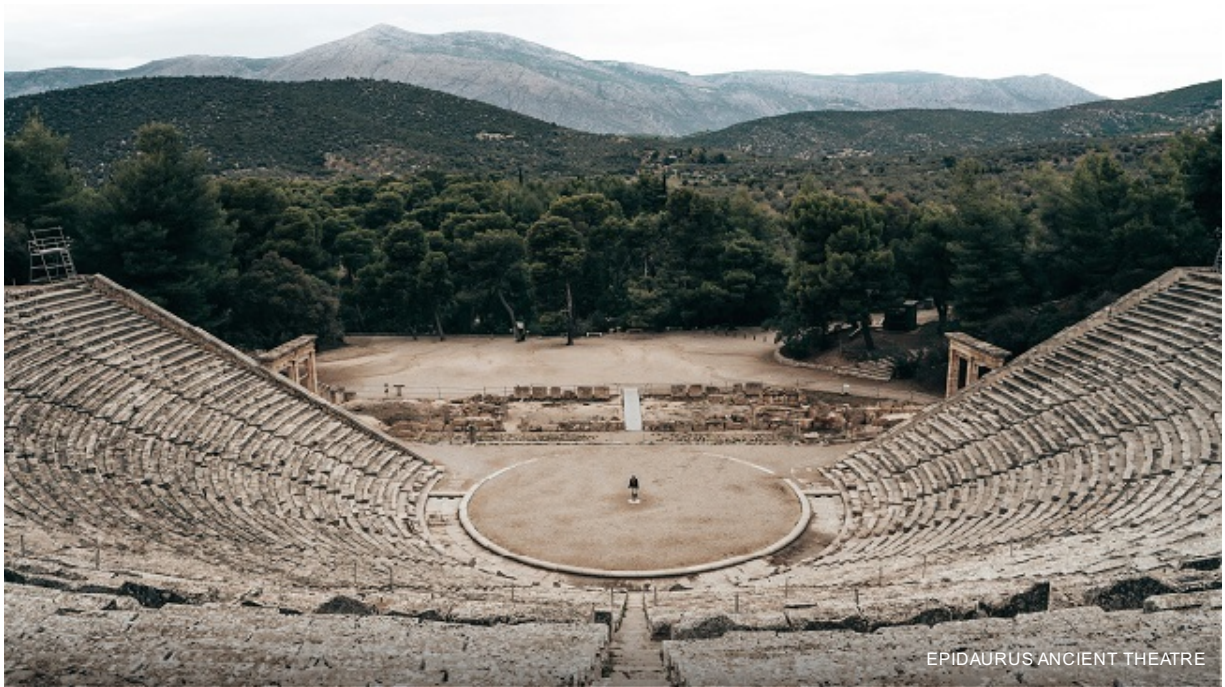
EPIDAUROS ANCIENT THEATRE