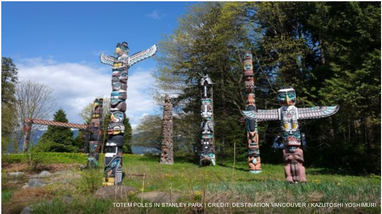
TOTEM POLES IN STANLEY PARK | CREDIT: DESTINATION VANCOUVER / KAZUTOSHI YOSHIMURI