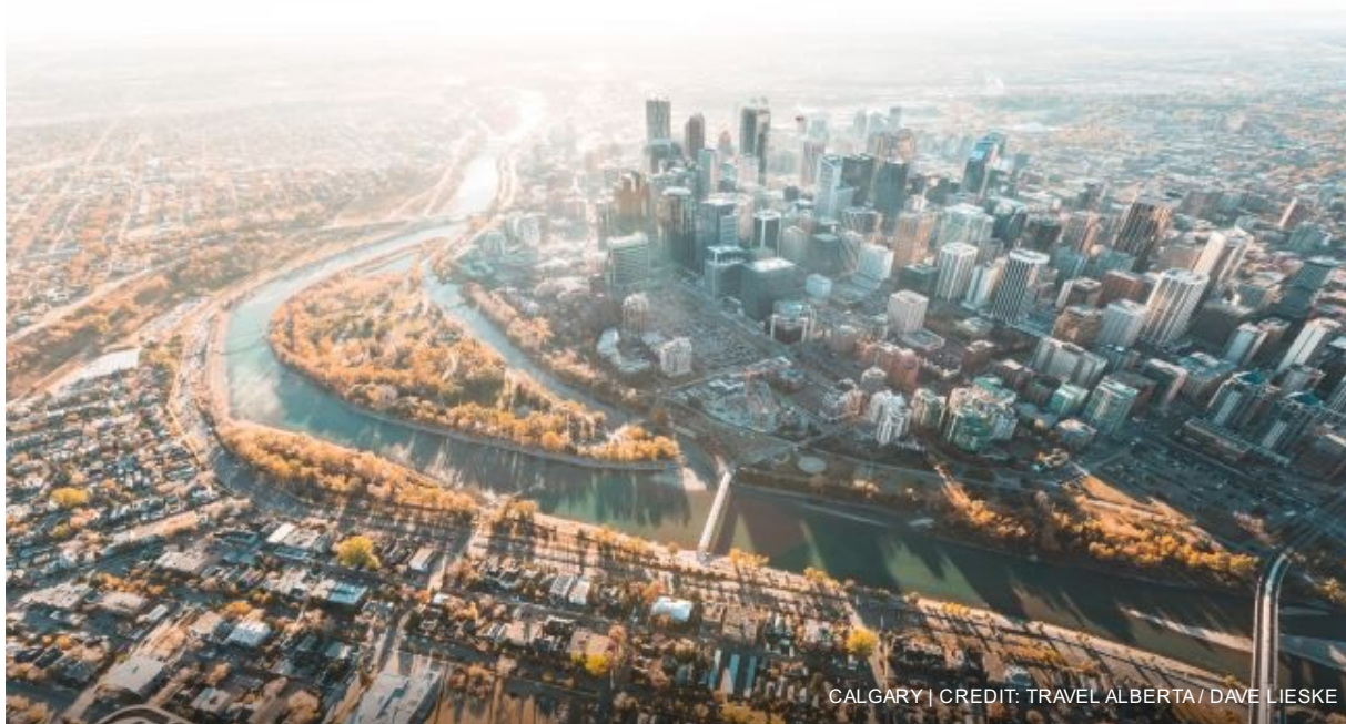
CALGARY | CREDIT: TRAVEL ALBERTA / DAVE LIESKE