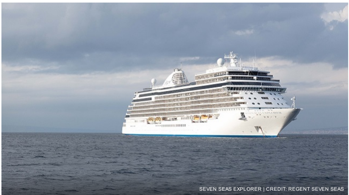
SEVEN SEAS EXPLORER