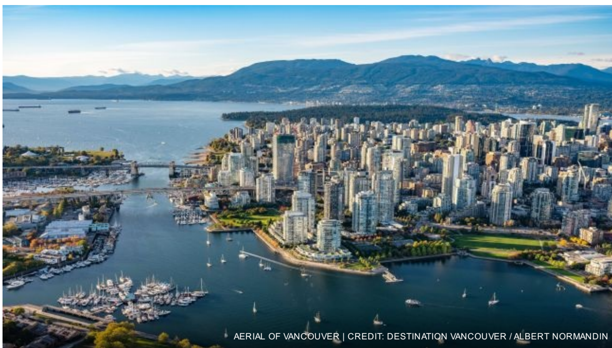
AERIAL OF VANCOUVER

Stanley Park is uniquely situated with incredibly scenic views of downtown Vancouver, the North Shore, the Lion's Gate Bridge, as well as English Bay and the West End. Weave down the pristine forest trails that criss-cross through the park, and receive incisive information about the amazing wilderness in the city. This is definitely more than just a ride in the park. You will walk or ride away with a deeper understanding of both Vancouver and its green treasure. An easy 12 km ride on dedicated bike trails. Tours always ride at a relaxed pace to take in the sights, so anyone with moderate fitness can easily do this ride!