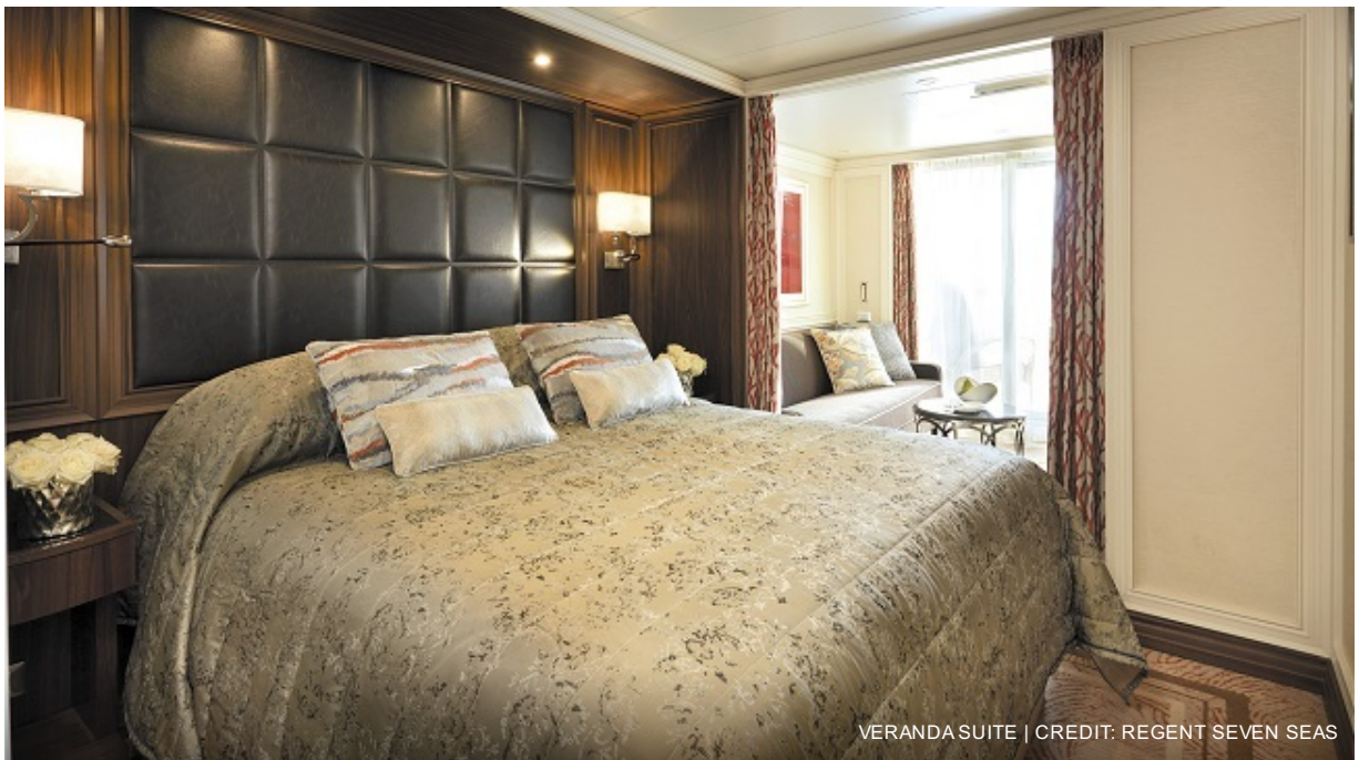
VERANDA SUITE | CREDIT: REGENT SEVEN SEAS

The Veranda Suite offers a warm, inviting sanctuary with a private balcony. Alongside the signature Elite Slumber™ bed, guests can enjoy luxurious bath amenities, an interactive flat-screen TV, and plush bathrobe and slippers. The cosy sitting area includes a perfectly sized table for a welcome bottle of Champagne or an in-suite breakfast, while 24-hour room service is always just a call away.