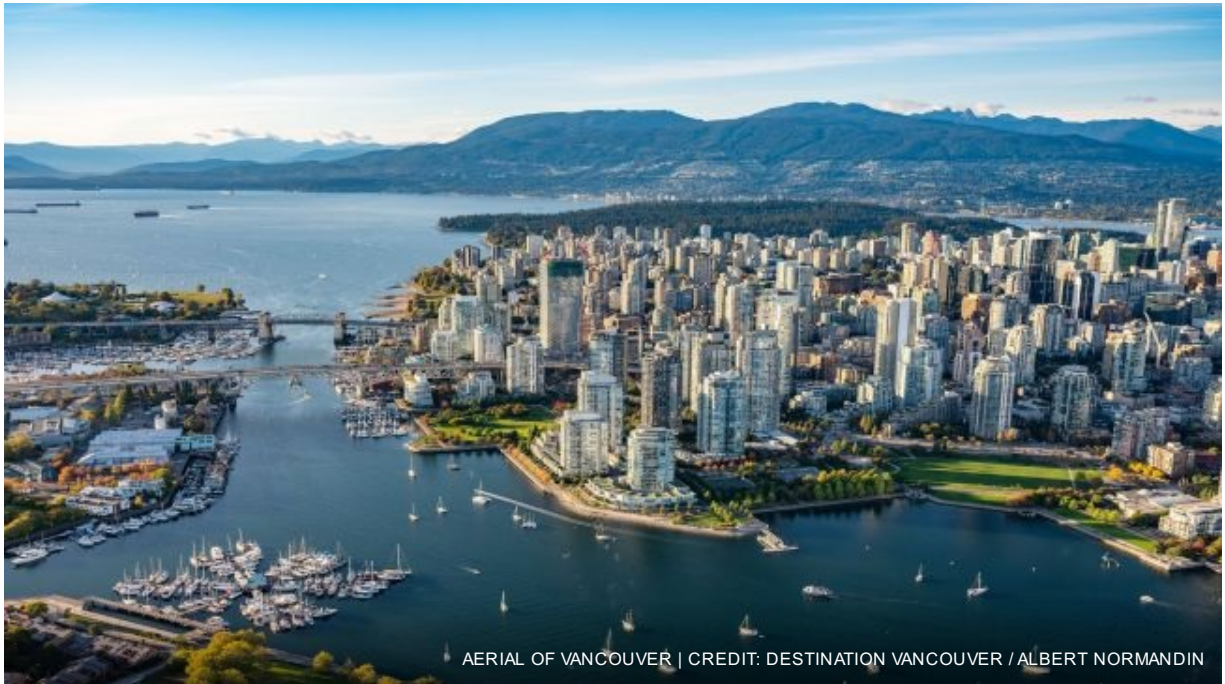
AERIAL OF VANCOUVER

Stanley Park is uniquely situated with incredibly scenic views of downtown Vancouver, the North Shore, the Lion's Gate Bridge, as well as English Bay and the West End. Weave down the pristine forest trails that criss-cross through the park, and receive incisive information about the amazing wilderness in the city. This is definitely more than just a ride in the park. You will walk or ride away with a deeper understanding of both Vancouver and its green treasure. An easy 12 km ride on dedicated bike trails. Tours always ride at a relaxed pace to take in the sights, so anyone with moderate fitness can easily do this ride!