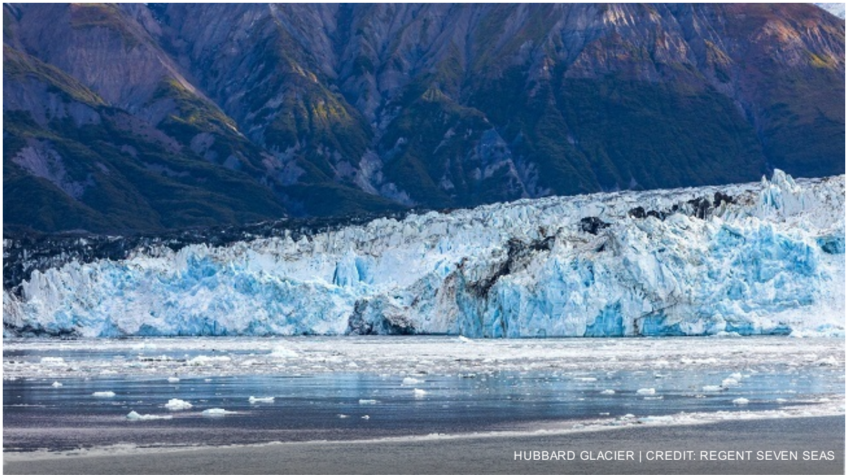
HUBBARD GLACIER