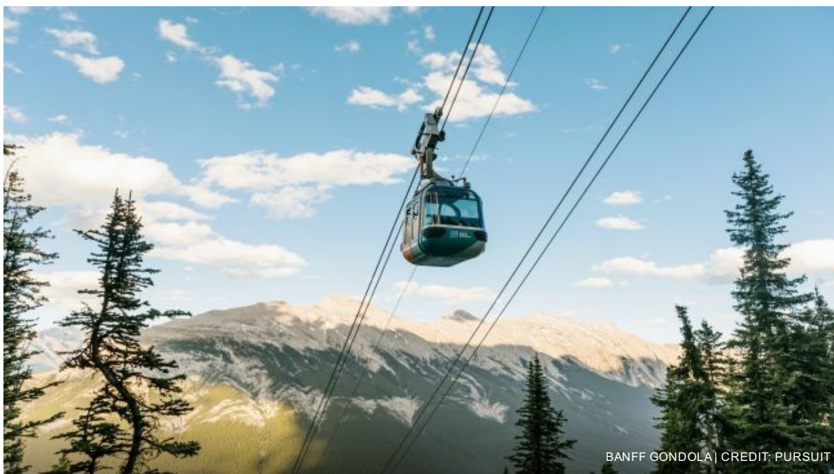
BANFF GONDOLA

Overnight in Banff at the Rimrock Resort