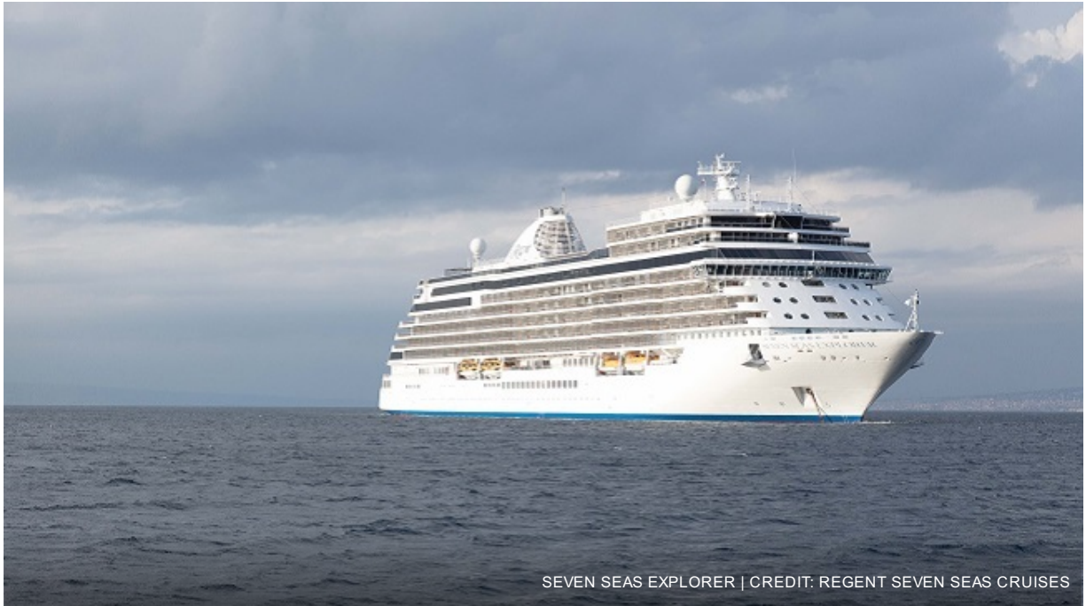
SEVEN SEAS EXPLORER | CREDIT: REGENT SEVEN SEAS CRUISES