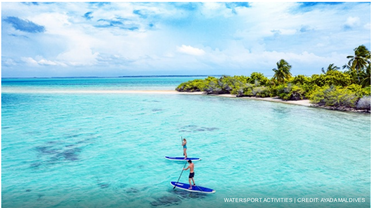
WATERSPORT ACTIVITIES