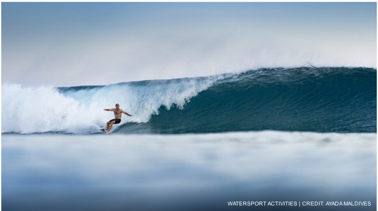
WATERSPORT ACTIVITIES