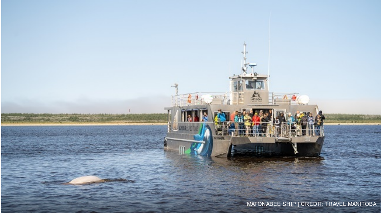
MATONABEE SHIP