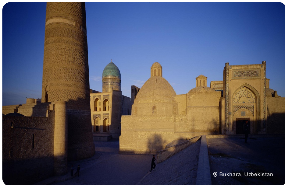
📍 Bukhara, Uzbekistan