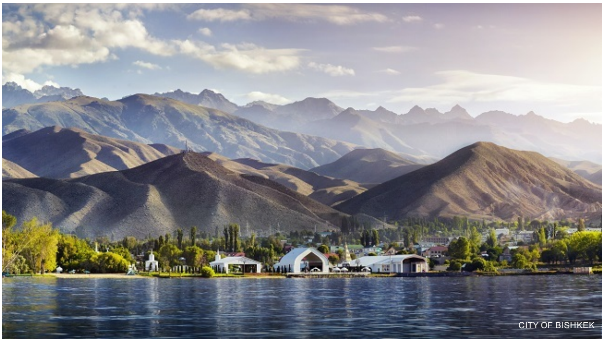
CITY OF BISHKEK