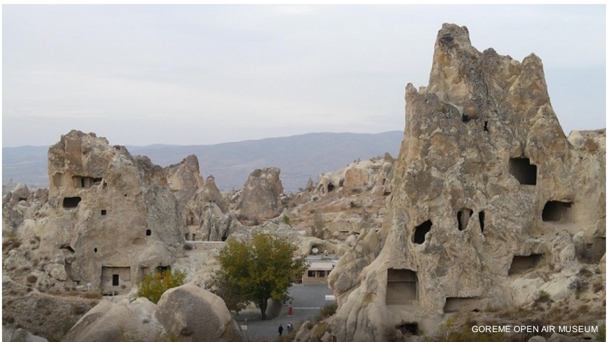
GOREME OPEN AIR MUSEUM