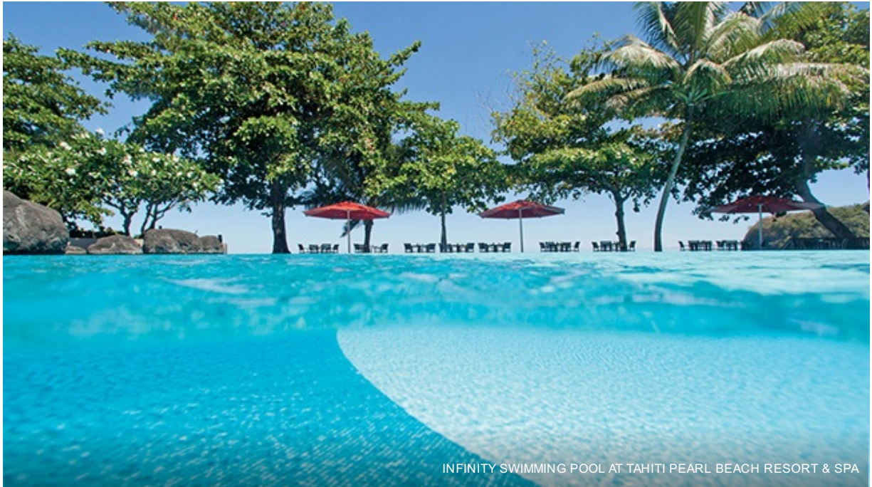
INFINITY SWIMMING POOL AT TAHITI PEARL BEACH RESORT & SPA