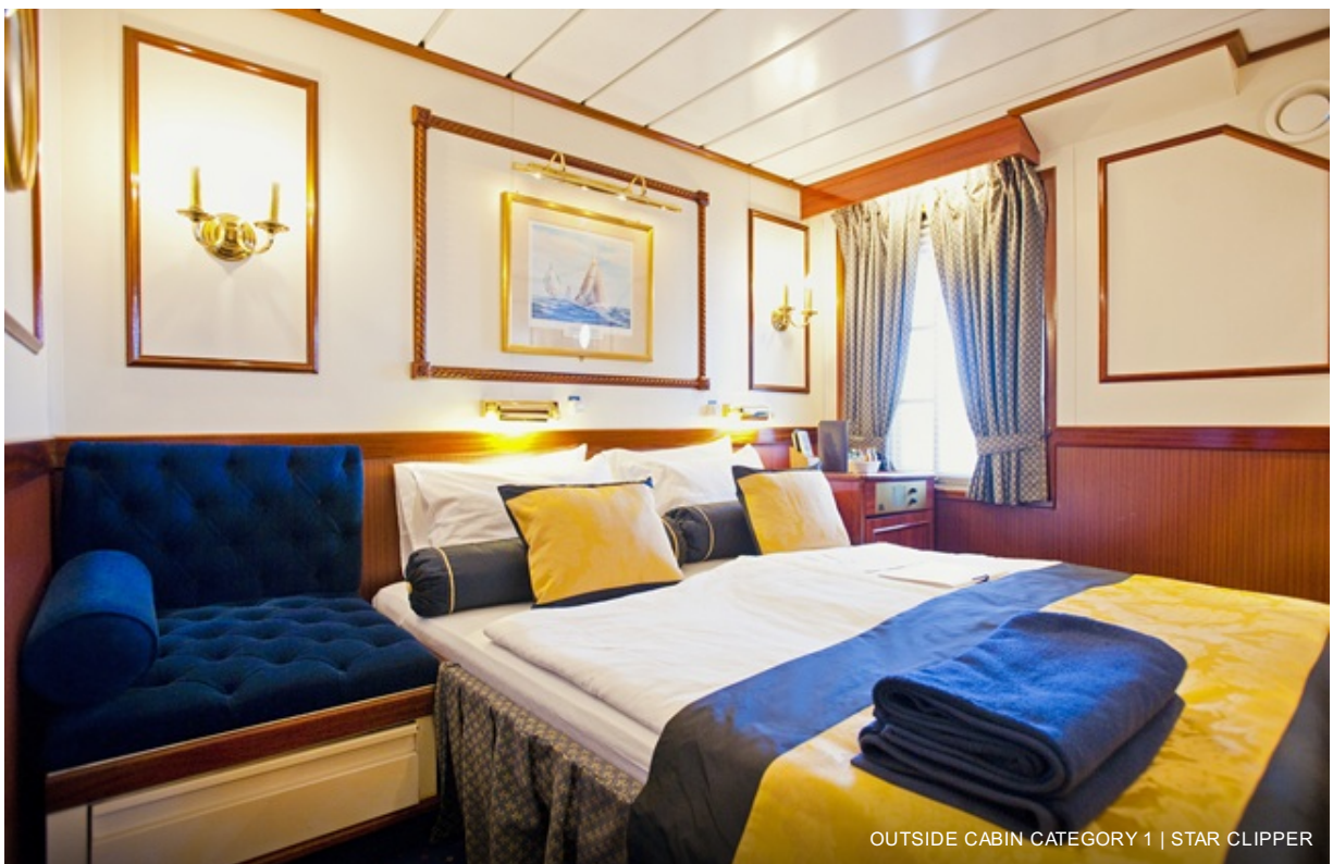
OUTSIDE CABIN CATEGORY 1 | STAR CLIPPER

Expansive teak decks offer more outdoor space per passenger than most conventional cruise ships, with two swimming pools, open-seating dining, a Tropical Bar, Piano Bar, and an Edwardian-style library. The décor evokes the grand age of sail with antique prints, paintings, and gleaming mahogany rails.