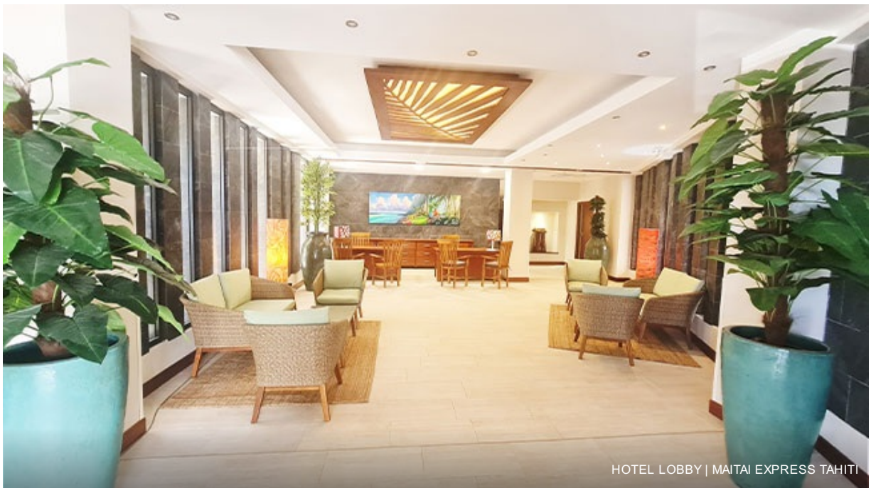
HOTEL LOBBY | MAITAI EXPRESS TAHITI