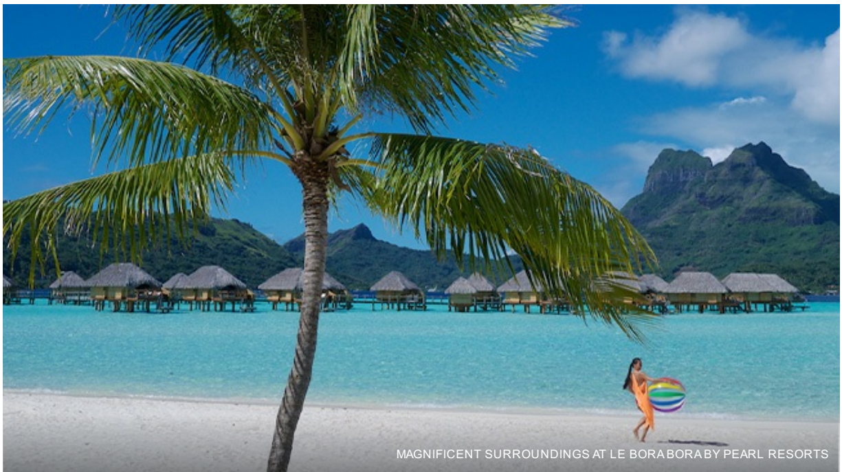
MAGNIFICENT SURROUNDINGS AT LE BORABORABY PEARL RESORTS