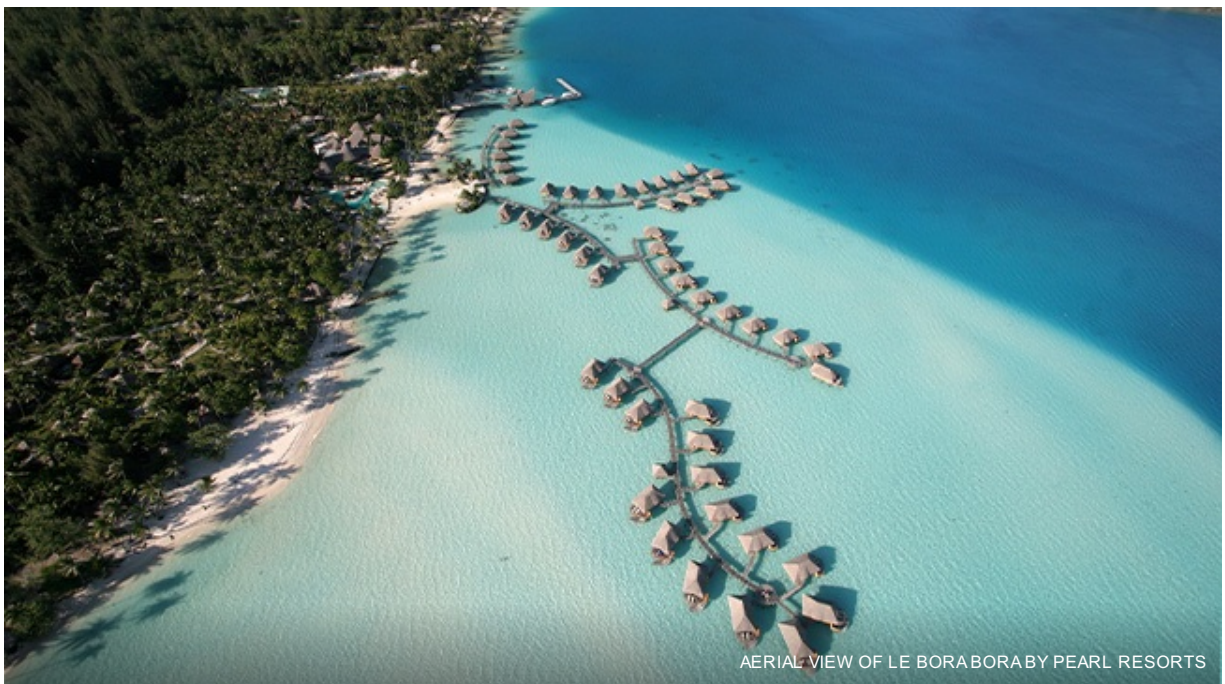
AERIAL VIEW OF LE BORABORABY PEARL RESORTS

Overnight stay in Bora Bora at Le Bora Bora by Pearl Resorts in a Garden Pool Villa.