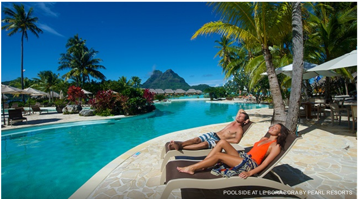
POOLSIDE AT LE BORABORABY PEARL RESORTS