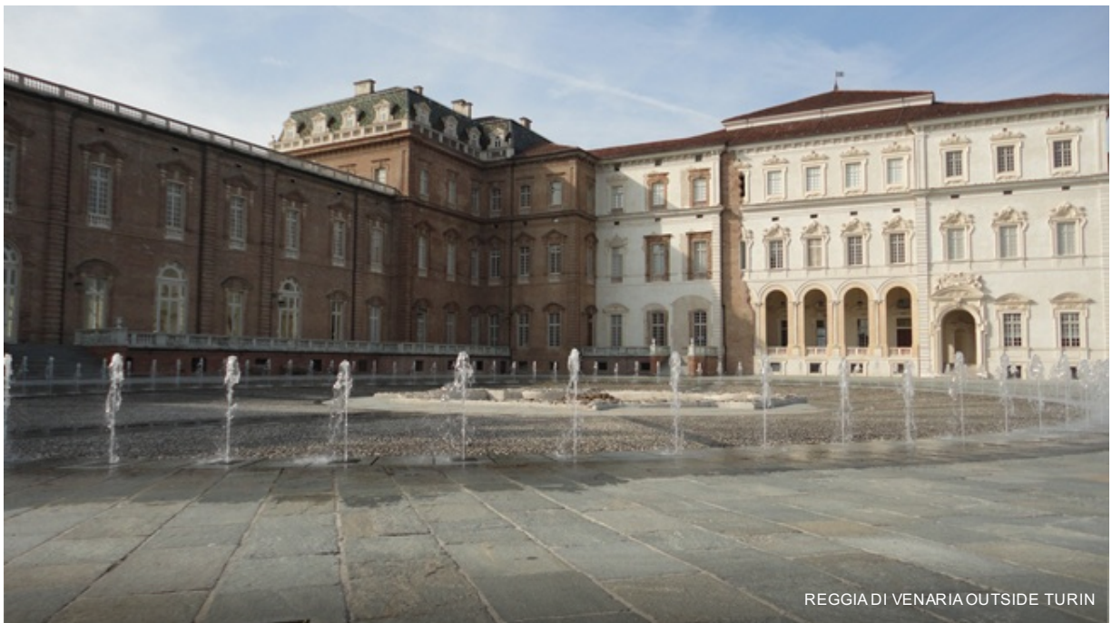
REGGIA DI VENARIA OUTSIDE TURIN