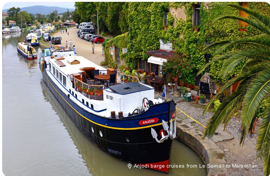
📍 Anjodi barge cruises from Le Somail to Marseillan.