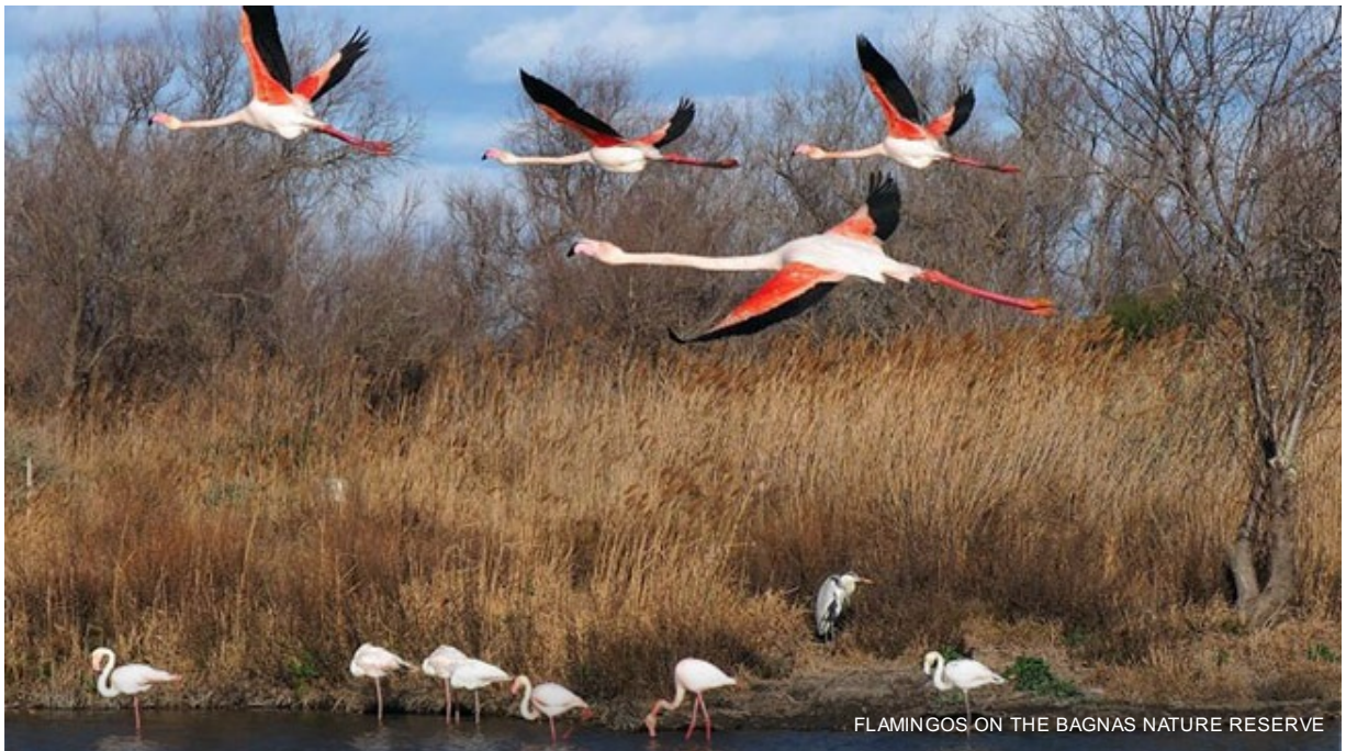
FLAMINGOS ON THE BAGNAS NATURE RESERVE