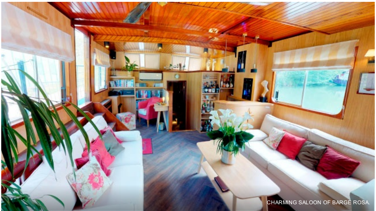
CHARMING SALOON OF BARGE ROSA.