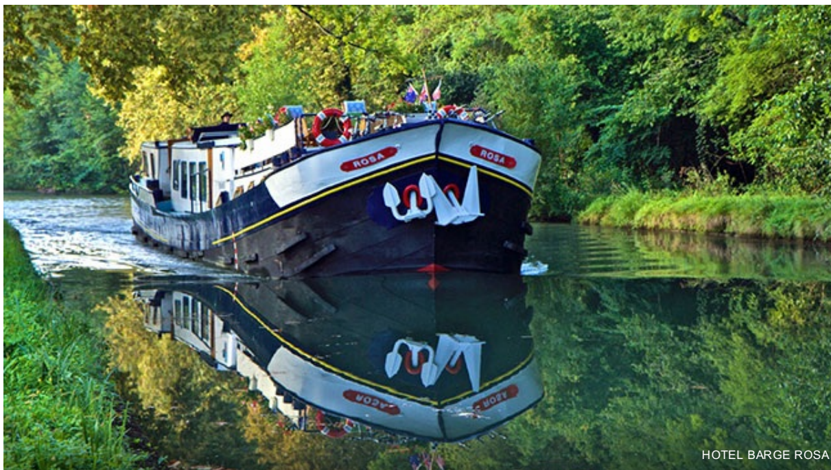
HOTEL BARGE ROSA